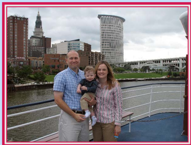
River Boat Lunch Cruise