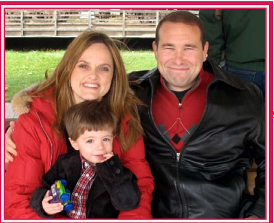
All Aboard! The Cuyahoga Scenic Railroad