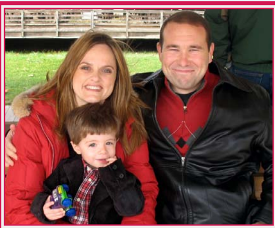
All Aboard! The Cuyahoga Scenic Railroad