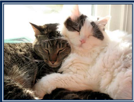
Two of Our Kitties, Scout and Shadow

We have five furry kitties-Shadow, Scout, Tink, Bella, & Kirby. We each adopted two of the cats from a rescue shelter before we were married, and we added Kirby to the family about a year later. We chose to have rescue kitties because we knew we could provide a home for them that they may not have ever had otherwise. They bring us such joy when they are snuggling with us while we are watching TV, laying with us in bed at night, or chasing around their collection of toy mice. Each one has a different personality and it is fun to see how they interact with each other and with people. Our kitties are extensions