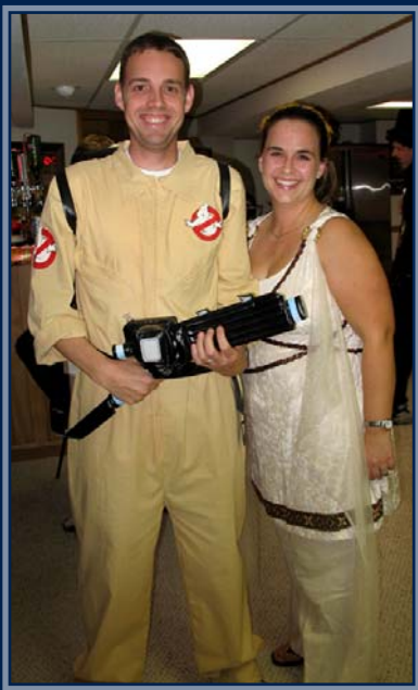
Only Ghostbusters and Greek Goddesses at this Halloween Party!