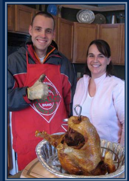
Our Thanksgiving Tradition - Frying a Turkey