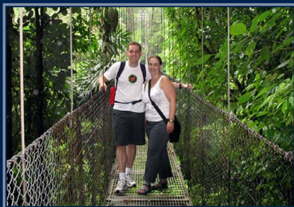
Hiking in the Rainforest in Costa Rica