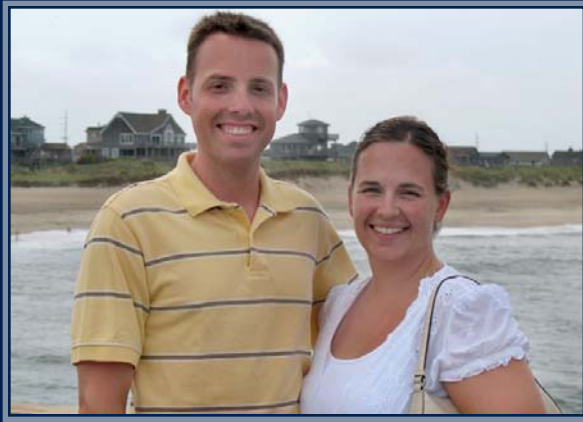
At the Pier in the Outer Banks, NC