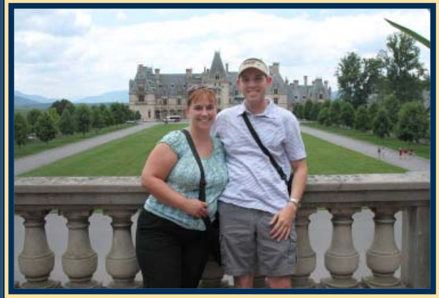
Visiting the Biltmore Estate in North Carolina