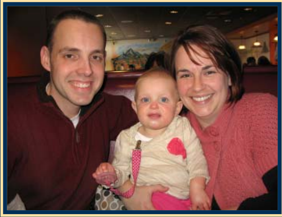
Out to Dinner with Friends