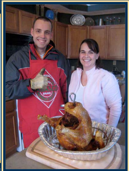
Our Thanksgiving Tradition - Frying a Turkey