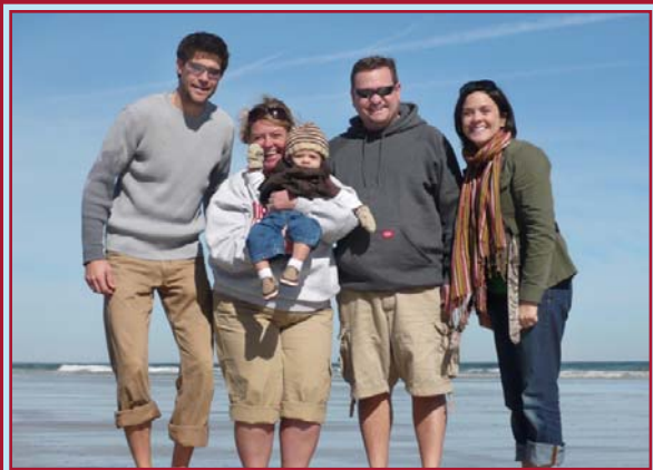
At the Beach with Family