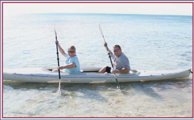
Kayaking in the Florida Keys