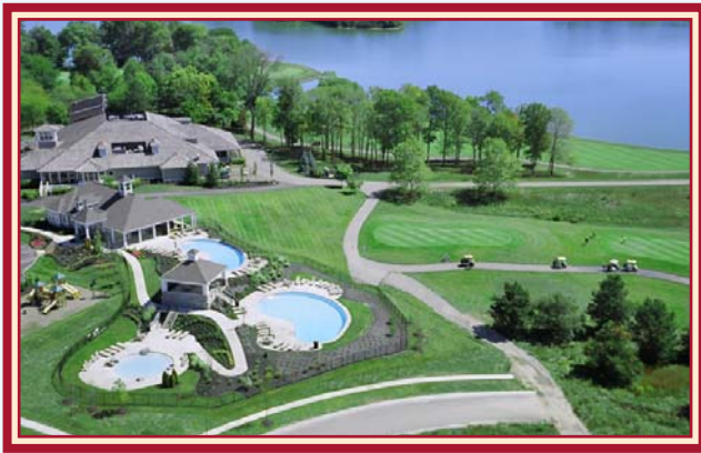
Our Community Pool and Club House