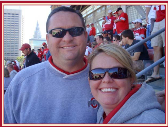
OSU Football Road Game