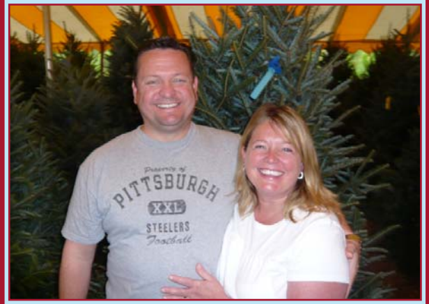
Christmas in Florida