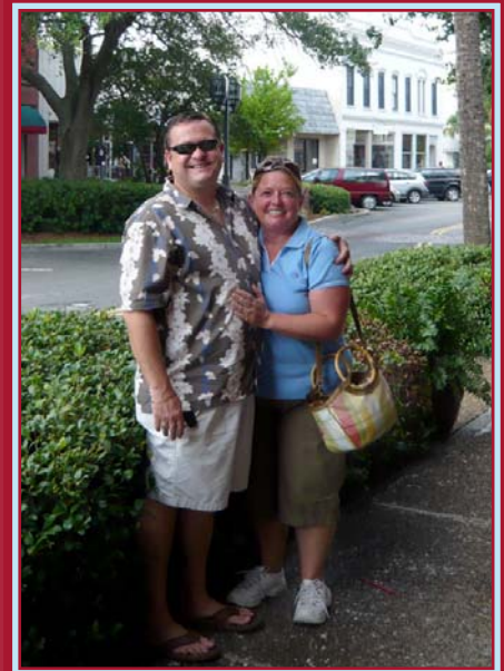
St. Augustine Florida