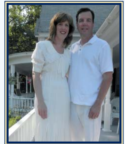
Annual Croquet Match