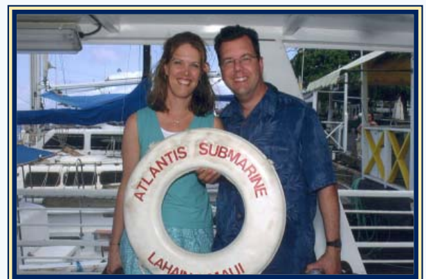
Our Honeymoon in Hawaii

We are fortunate to live close to a wonderful park system. When the spring weather turns warm, we ride to the bike path to enjoy the fresh air and the many joining trails. You will also find us hiking, walking or rollerblading! We enjoy trying new recipes and cooking together. Grilling in the summertime with the tasty herbs from our garden is the best!