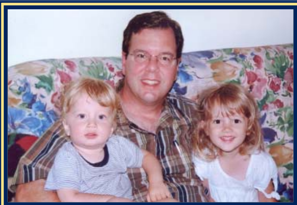
"We Love Hanging Out with Uncle Bill!"