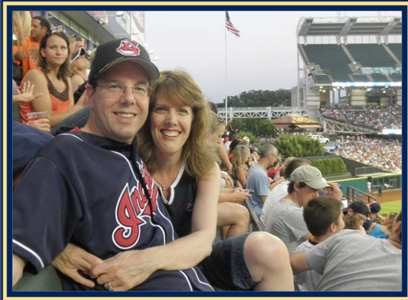
Cheering for the Indians