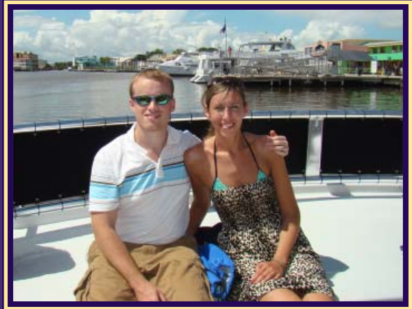
Enjoying a Boat Ride in Belize