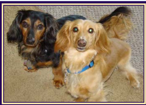
Jack and Charlie

We have two dogs, Charlie and Jack, and two cats, Mr. Henry and Oliver. Charlie and Jack are both longhaired dachshunds. They both love other animals and are very loyal to their family. There is never a dull moment with these two. They are the first to snuggle up with us on the couch at the end of the day, but also the first to let us know if we are a few minutes late giving them their dinner.