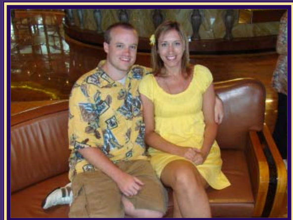
Out to Dinner