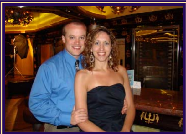
Taking a Cruise