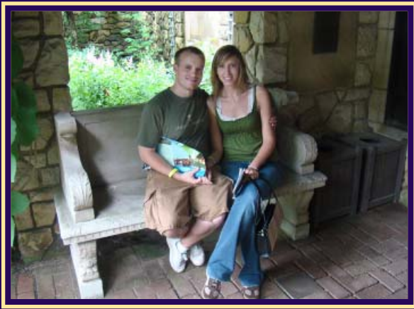
Weekend Trip to the Gardens