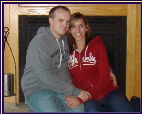
Cozying Up By The Fireplace