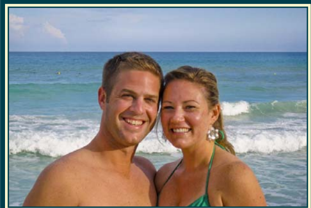
In Mexico Along the Beach