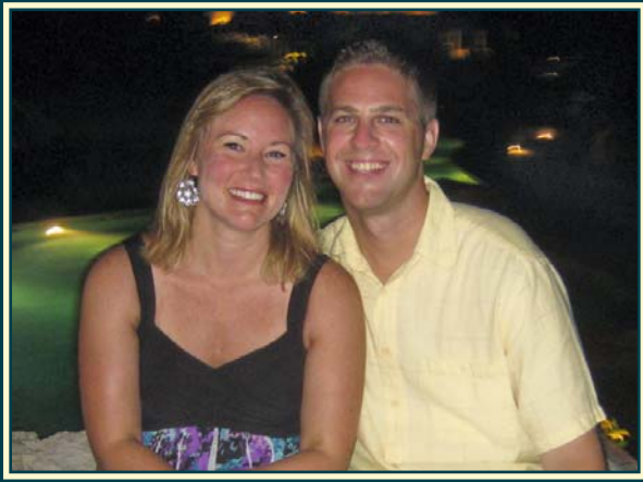
In Mexico on Vacation