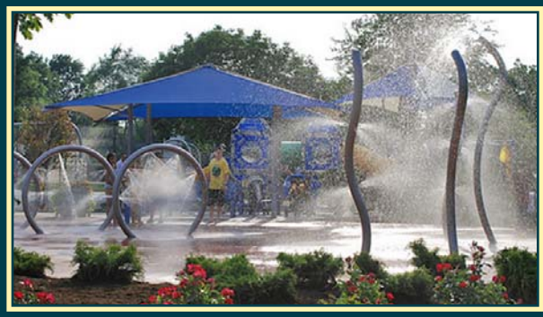
The Park in Our Neighborhood