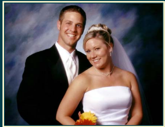
On Our Wedding Day in 2003