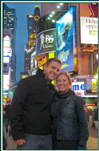
In Times Square, NYC