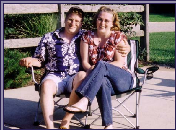
Relaxing at a Family Reunion