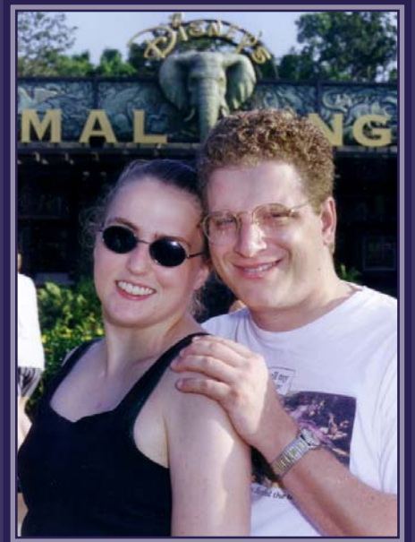
Visiting the Animal Kingdom at Disney World