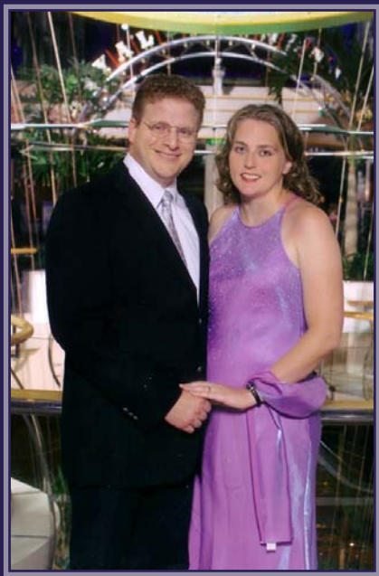
Enjoying Formal Night on Our Caribbean Cruise