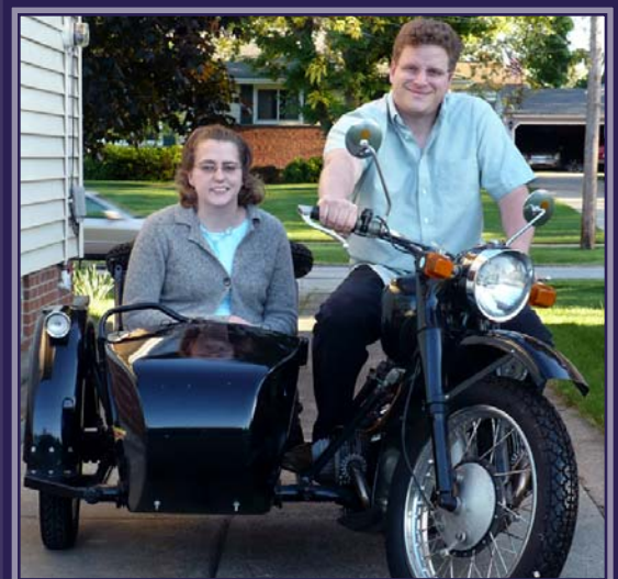
On Our Motorcycle