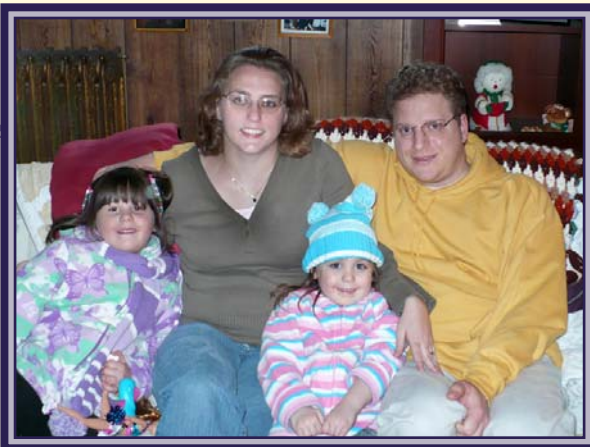
With Our Nieces at Christmas

Our parents both instilled in us how truly important it was to get a good education. We both pursued secondary educations and have gained so much from it. We hope to serve as good examples to this child of the benefits of going as far as you can to reach your goals. We will do our best to nurture his/her talents and help them to achieve whatever they want to be when they grow up. We will strive to find schools that will provide him or her with a quality education, and look forward to helping them with homework and creating class projects. We will encourage and support the child's decision to further his/her education beyond high school and hope they go on to be a good example to others.