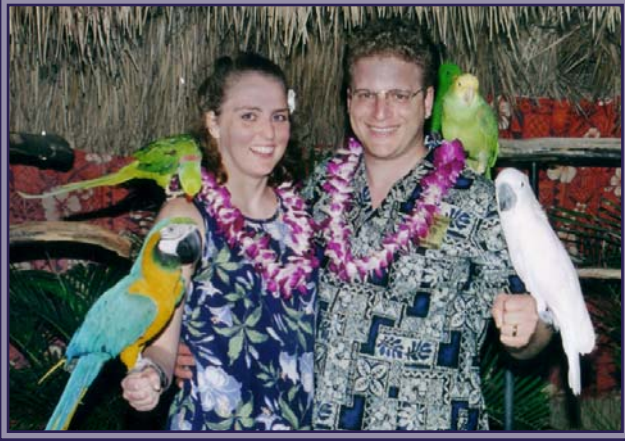
At a Luau in Hawaii