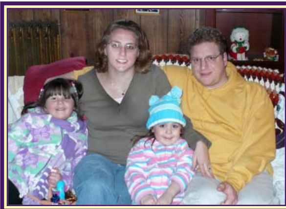
With Our Nieces at Christmas

Our parents both instilled in us how truly important it was to get a good education. We both pursued secondary educations and have gained so much from it. We hope to serve as good examples to this child of the benefits of going as far as you can to reach your goals. We will do our best to nurture his/her talents and help them to achieve whatever they want to be when they grow up.