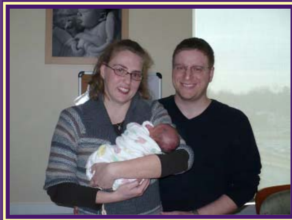
Proud New Parents