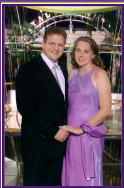
Enjoying Formal Night on Our Caribbean Cruise