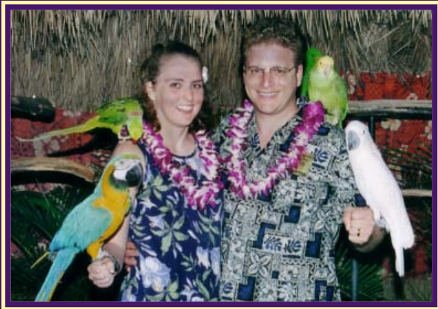
At a Luau in Hawaii