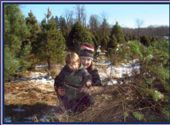
Cutting Down Our Christmas Tree with Nephew