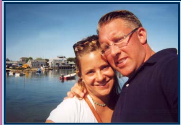
Nantucket Harbor - Our Favorite Vacation Spot