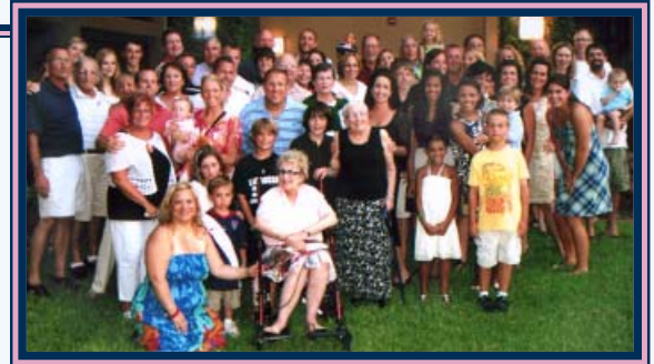
Family Reunion 2010