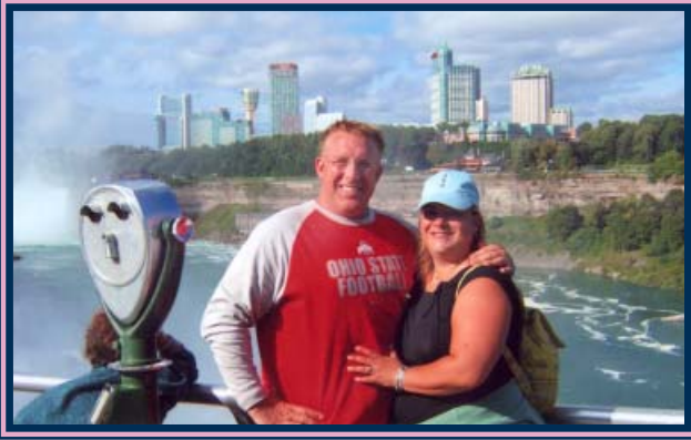
We Loved Our Trip to Niagara Falls!