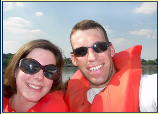
Paddleboating in D.C.