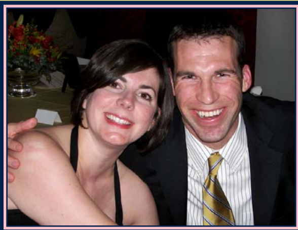
Attending a Friend's Wedding