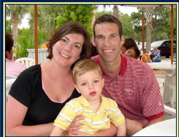
On the Patio at The Salty Dog