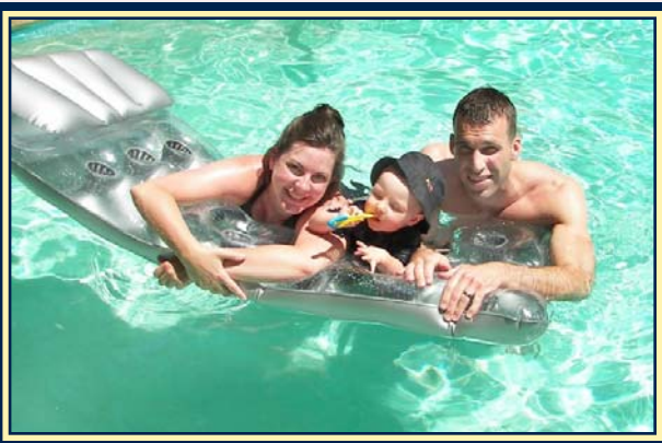
Pool Fun in Hilton Head