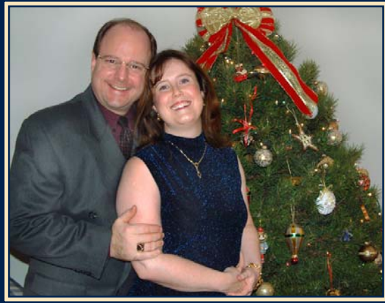
On Our Way to A Christmas Party