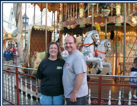
At The Boardwalk