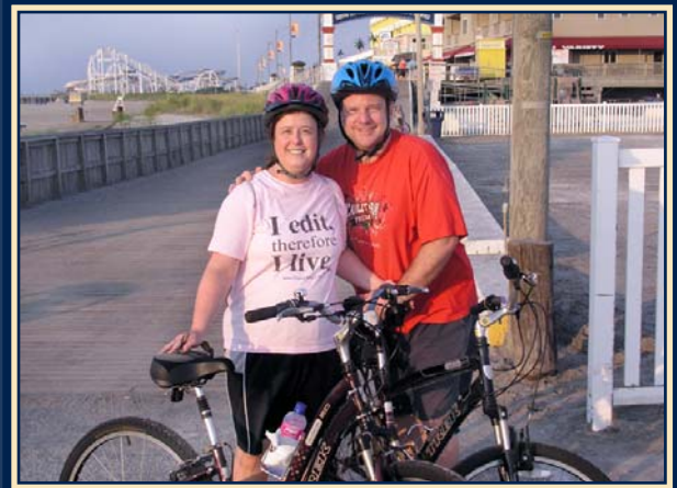
Morning Bike Ride on Vacation