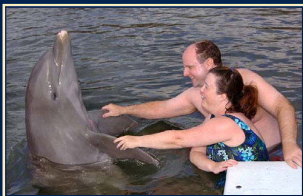
Swimming with Dolphins in Florida