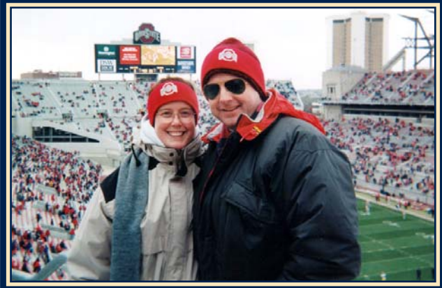
Cheering on the Buckeyes at Ohio Stadium