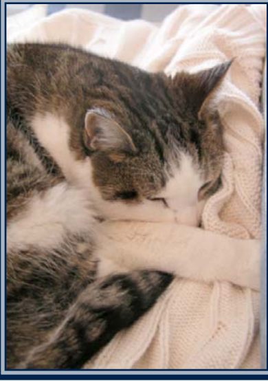
Our Cat, Mischief, Asleep on the Couch

We recently put up birdfeeders in our back yard so we can watch the goldfinches and the hummingbirds. We share our home with one cat, who we brought home as a kitten when she was found on the city streets of a small Ohio town. We have decorated our family room with a flight theme, inspired by our hot air ballooning activities, Dave's flying and our memories of celebrating the 100th anniversary of flight in 2003.