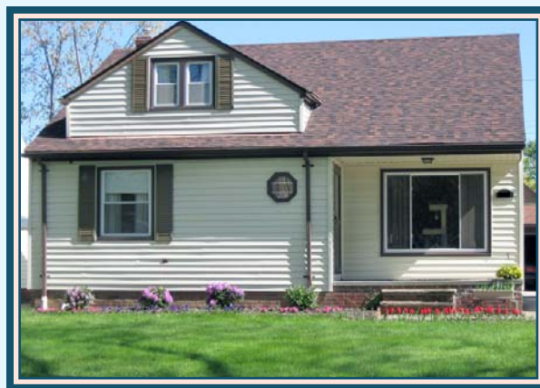
There's No Place Like Home!