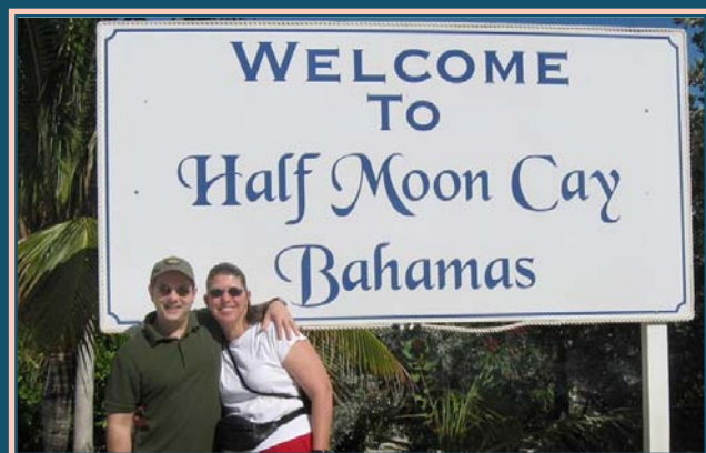
Half Moon Cay Vacation