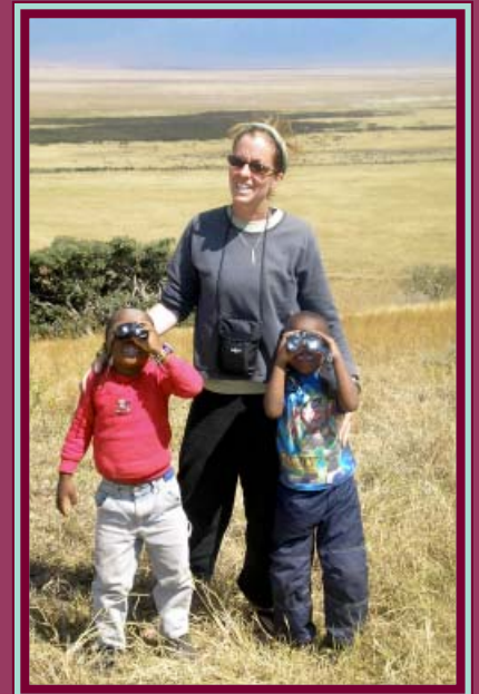
Working in Tanzania