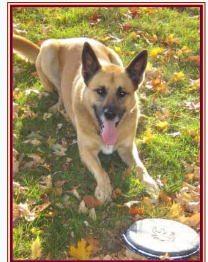
Willow Ready to Play

I have an older horse as well, Miracle. He was a rescue, he had been badly neglected and I was lucky enough to be able to adopt him. He is kept at an area barn where I ride him a few days a week and the barn uses him for horseback riding lessons for children. He is a gentle soul and I love him so much.