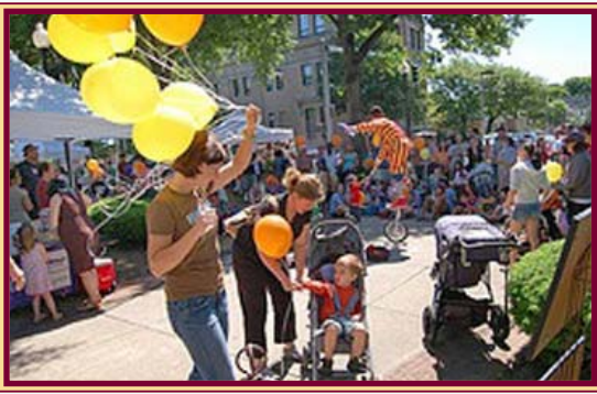
The Weekly Local Farmer's Market

Within walking distance from my house is the center of town, with its local cafes, restaurants, ice cream shop, bookstore and weekly farmer's market. The community center has an indoor swimming pool with a very successful youth swim team, as well as after school programs, day care, playgrounds and playing fields. There are two K-8 schools within walking distance; both schools have excellent reputations. As well, there are a number of religiously affiliated private schools and a nationally recognized charter school. Public transportation is also within walking distance from my house, which provides me with easy access to Boston's great museums, historical sites and shopping, all within a 20-minute train ride.