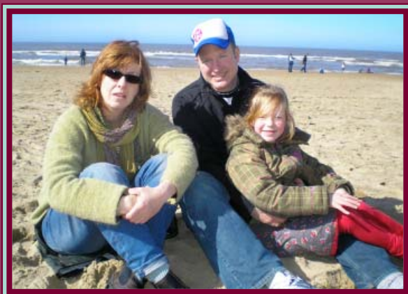
With Pals in Amsterdam