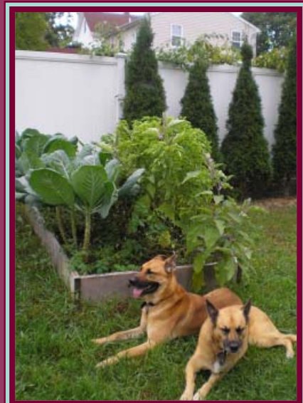
Scout and Willow in My Garden