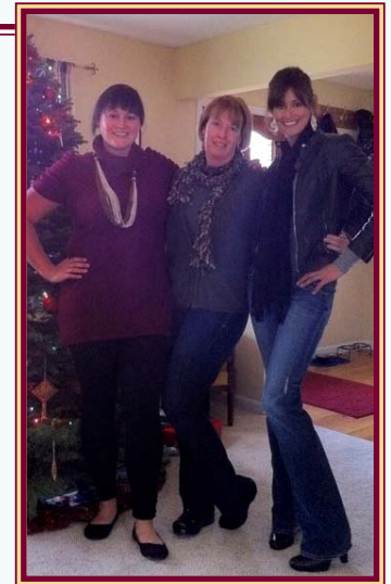
Christmas Season with My Nieces