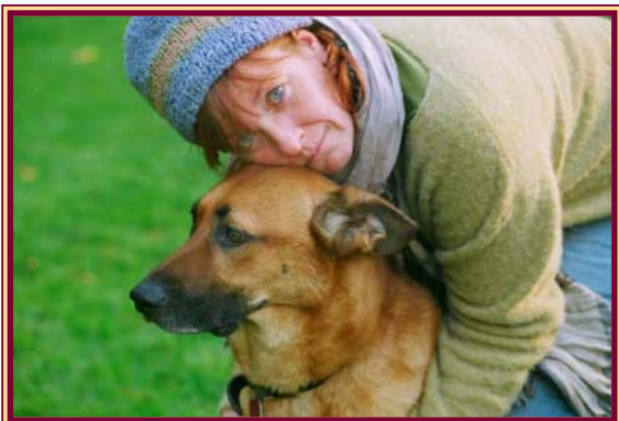
Me and Scout Together

Scout came to me when he was just one year old. Someone had left him on a city street and just abandoned him. He is a truly loyal, gentle and amazing dog. Scout has earned his international certification as a therapy dog. In my work with children, I also spend one morning per week with children who have serious mental illness. Scout comes along with me to work with the kids. He is so amazingly special with children and they all love all love him. He knows how to sit quietly and let them hug him, pet him and love him. He also goes to nursing homes to work with elderly patients and to children's hospitals to visit children who are receiving cancer treatment.