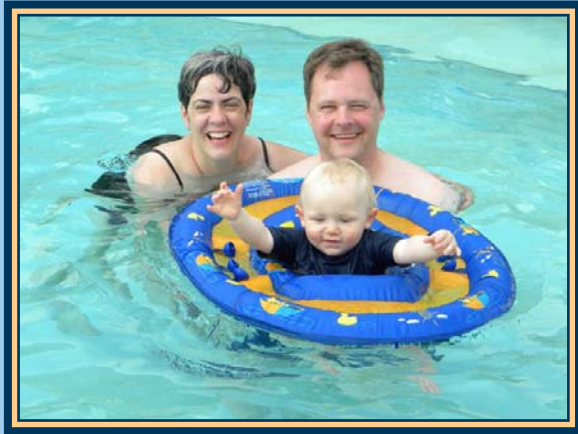
Swimming in Our Neighbor's Pool