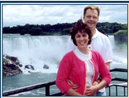
At Niagara Falls, Canada