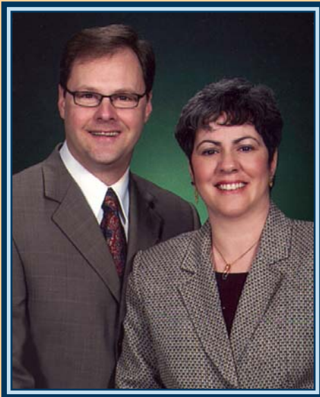
Dressed for an Evening Out