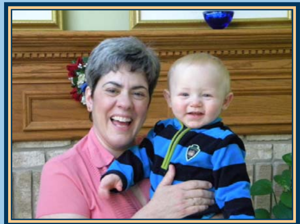
Laughing at Daddy's Funny Faces