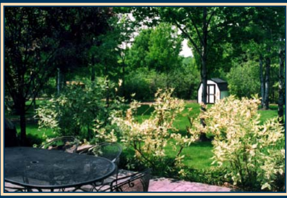
Back Patio of Our Home

Our home sits on a little over a half acre. We have a large backyard complete with green grass and many trees to play with cousins and the neighborhood children. Our home is part of a suburb residential development and it is close proximity to our parish church and school, major hospital complexes, and shopping. Best of all, it is home to one of the best park systems with many miles of biking, hiking trails, and plenty of picnic spots.