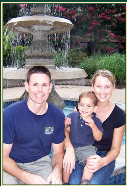
Enjoying the Park and Fountains