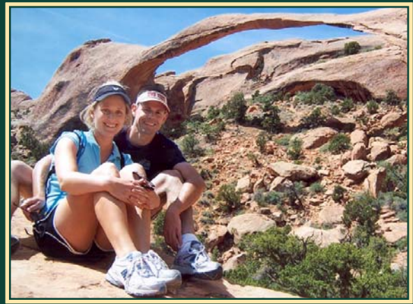
Hiking in Utah