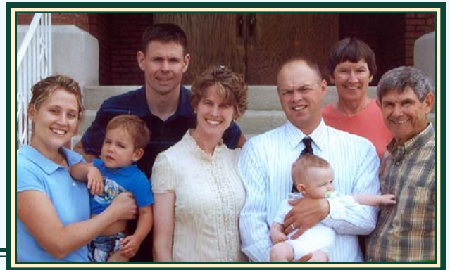
Greg's Extended Family

The best thing about our neighborhood is the support it gives to each family. There were neighborhood kids and adults waiting in our driveway to welcome us home the day Jacob arrived.