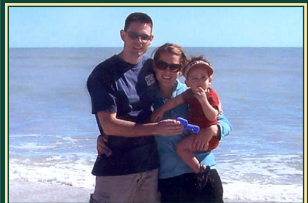
Vacation in Florida