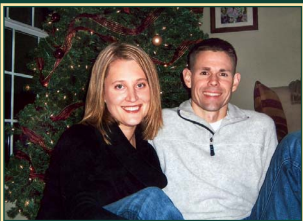
Enjoying the Holidays