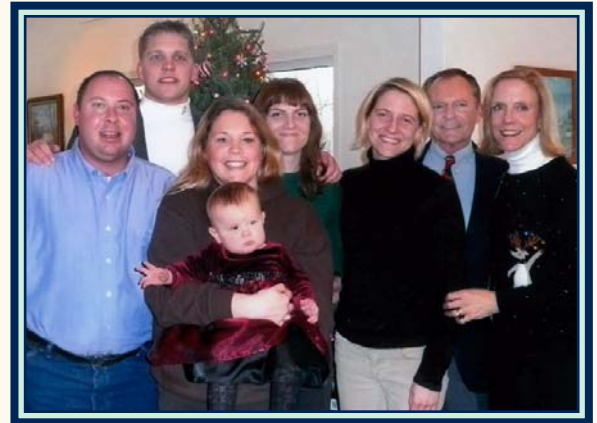
Spending Christmas with Loved Ones