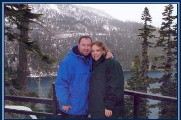
Overlooking Lake Tahoe