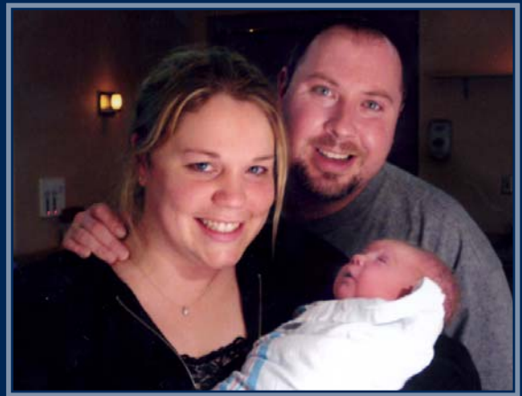
The Birth of Our Daughter