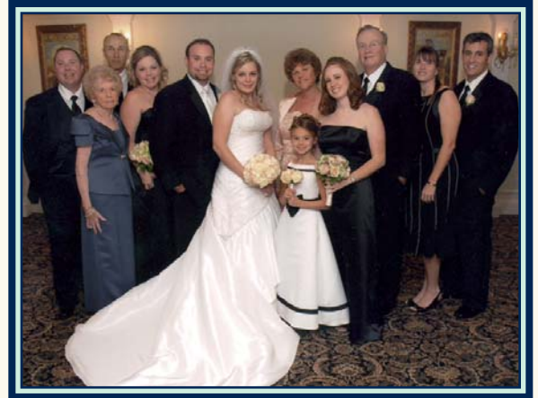
A Recent Family Wedding

We were both fortunate to be raised in loving homes where family and helping others were the most important things.