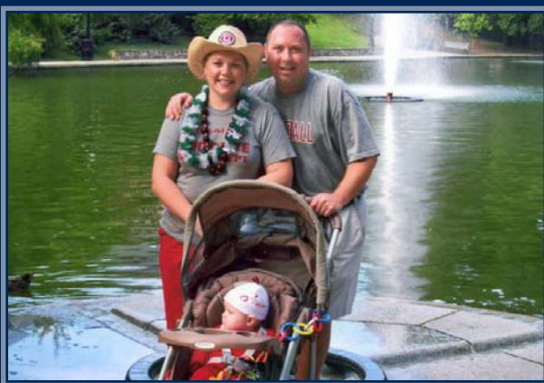
Going to an Ohio State Buckeyes Football Game