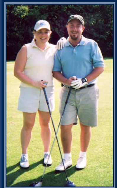
Hitting the Links