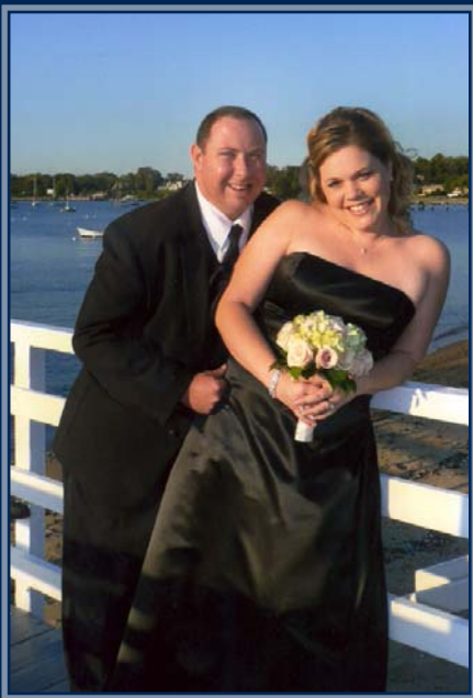
All Dressed Up