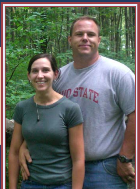
Hiking through the Woods