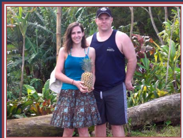
Vacationing in Hawaii