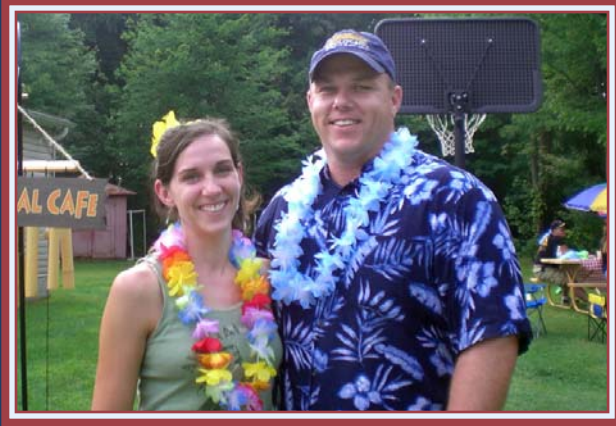
At a Pennsylvania Luau