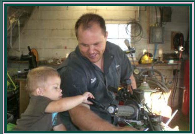
Working in the Garage