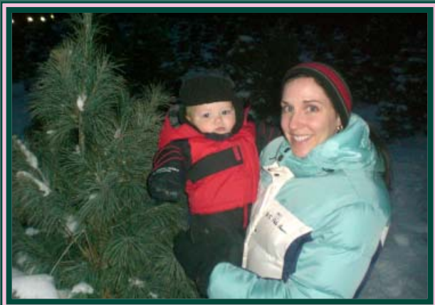
Picking Out Our Christmas Tree