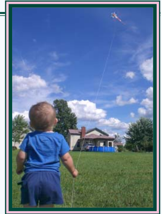
Flying a Kite in Our Backyard

Our house is a century old farmhouse with five bedrooms. We have three acres of land and plan to enclose a section of it off the kitchen to accommodate a swing set and a patio. Our home has been childproofed since we moved in, as many small nieces and nephews come over frequently. We have made many improvements to our home since we moved in, such as new windows and doors. We have a furnished guestroom and are always happy to have family or friends overnight. We take pride in making our home cozy and comfortable for our guests and ourselves.