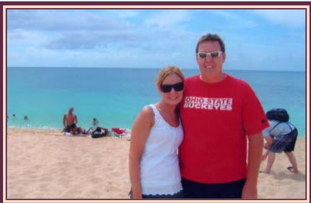
On the Beautiful Beaches of Hawaii

Our favorite vacation spot is somewhere warm with sand and warm water. We enjoy the calmness of the ocean waves. The best vacation is when family and friends get to join us. We have visited family several times in Florida and have had the chance to visit different beaches while we were there.