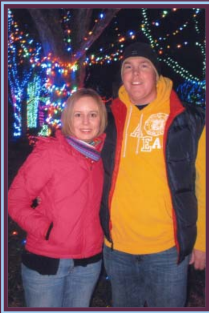
Christmas "Wild Lights" at the Zoo!