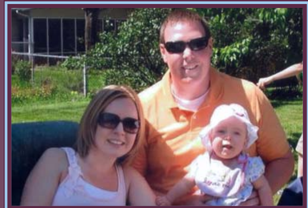
Celebrating Grandma's 90th Birthday with Our Youngest Niece