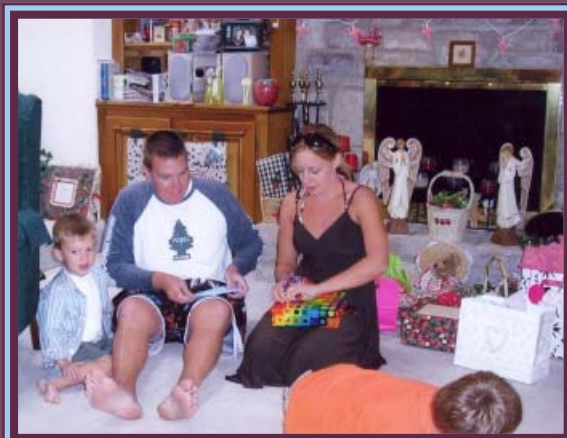
Opening Gifts at a Family Gathering