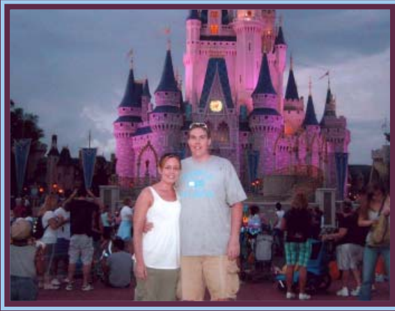
A Trip to Disney World