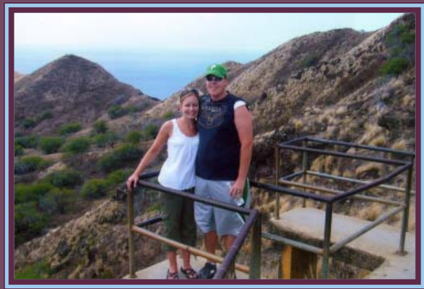
Hiking a Volcano on Our Honeymoon in Hawaii