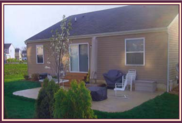
Back of Our House