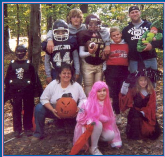
Annual Halloween Camping Trip with My Nieces and Cousins