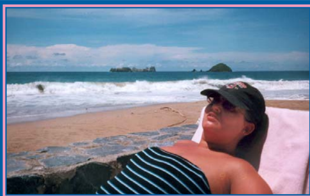
At the Pool in Mexico