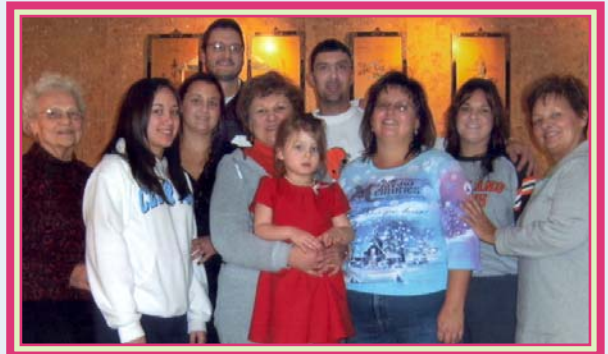
Christmas with My Mom's Family at My House