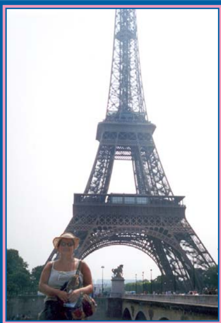
A Day in Paris