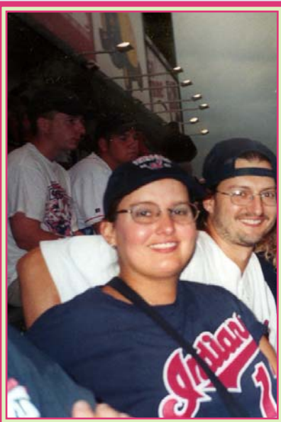
Indian's Game with My Brother

Sports, brings me to another family tradition, mainly watching sports. My brother has season tickets to the Cleveland Browns since forever and he takes me yearly to games with him. I also try to go watch different sporting events live such as baseball, basketball, football, NASCAR, horse racing, ice skating, etc. Win or lose, it's always fun to go root for your favorite team live. Much better than watching on TV! There are still several sports I'd love to catch live but until then I may have to settle for kick-ball in the back yard or the Olympics on TV! I'm a BIG Olympics' fan and I'm excited about the summer Olympics this year and can't wait for the next winter Olympics.