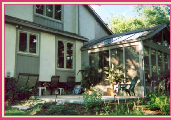
The Back of My Home

are also newer and very well funded, making this a great neighborhood to raise a child.