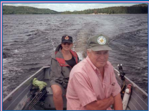
Fishing with My Dad