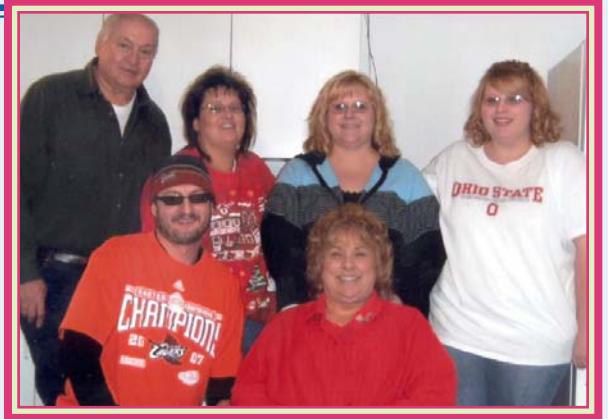
Christmas with My Dad's Family