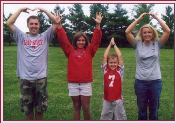
Having Fun Cheering for Ohio State with Our Niece and Nephew