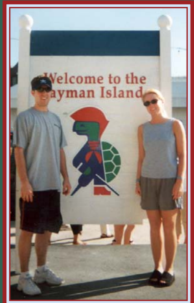
Getting Ready to Snorkel in Grand Cayman