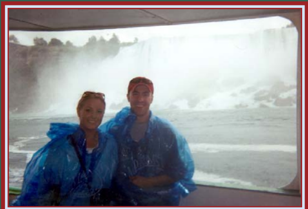
On Our Honeymoon in Niagara Falls