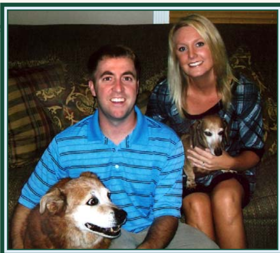
Spending Time with Dana and Lucy