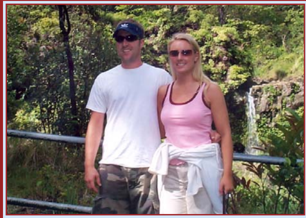
Our Vacation in the Hawaiian Rainforest