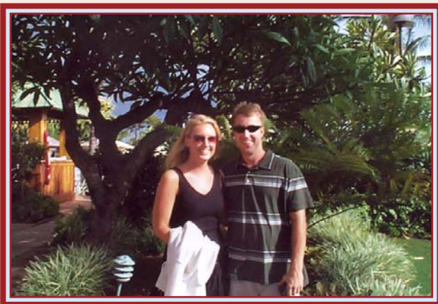
Luau in Hawaii