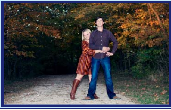
Walking in a Park Near Our Home

We have a large back yard with a deck where we like to sit and relax, let our dog run around or entertain family and friends. Our favorite thing is to have all of our friends, their kids, and our families over for dinner on the deck during the summertime.