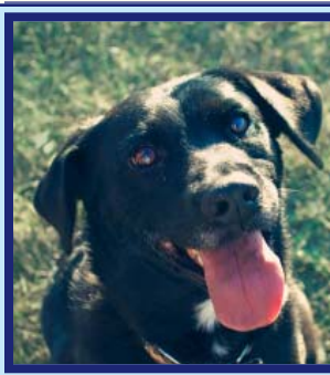
Our Dog, Sampson