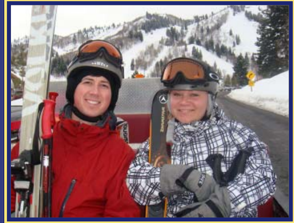
Getting Ready to Hit the Slopes