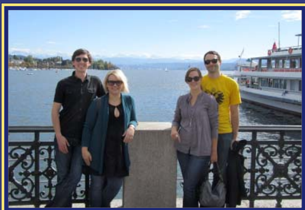
With Our Best Friends Near Their House in Switzerland