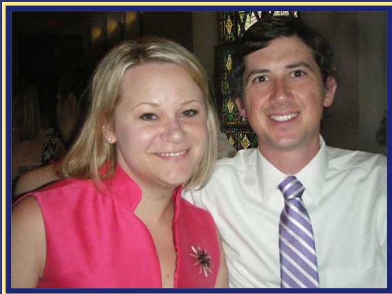
Celebrating Our Friend's Wedding