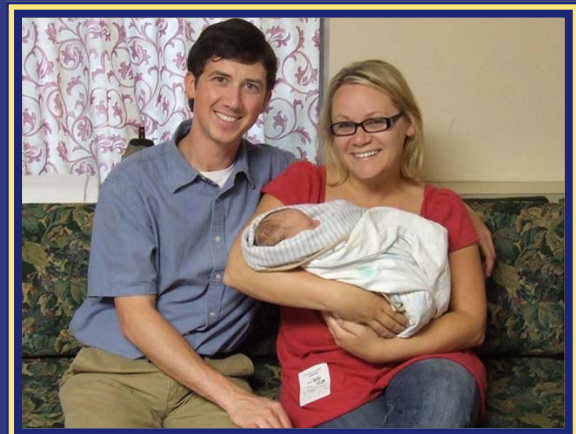
Holding Our Friend's New-Born Baby at the Hospital