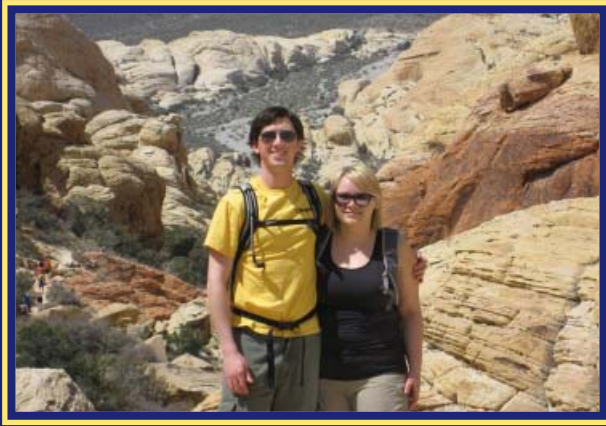
Hiking the Red Rocks Near Las Vegas