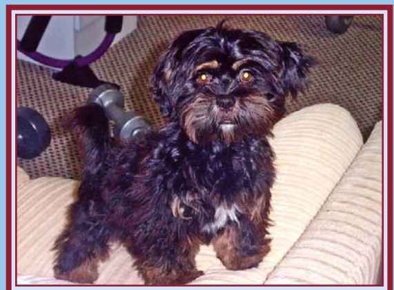
Our Dog, Brandy