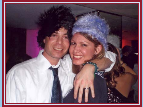
Family Event in Chicago