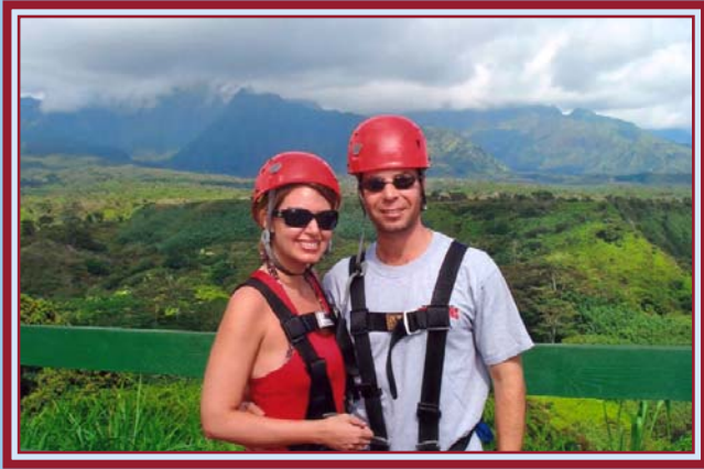
On a Zip Line in Hawaii