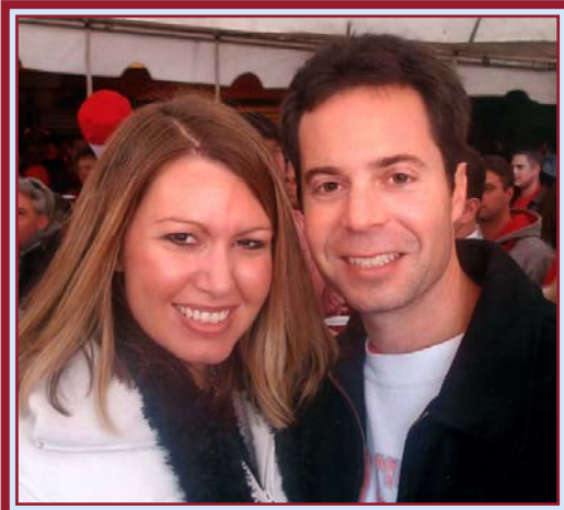
Attending a Buckeye Football Game