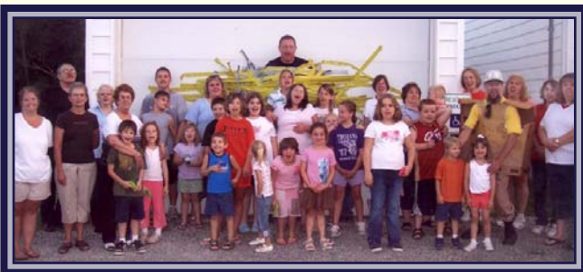
Our Church Taping the Pastor to the Garage After Vacation Bible School

Our faith and love in God is an important part of our lives. He has certainly given us the strength and wisdom to make it through some difficult times. Both of our children were born prematurely with health complications. God worked his miracles through the doctors in the hospitals to care for our children and allowed us to bring them home to love.