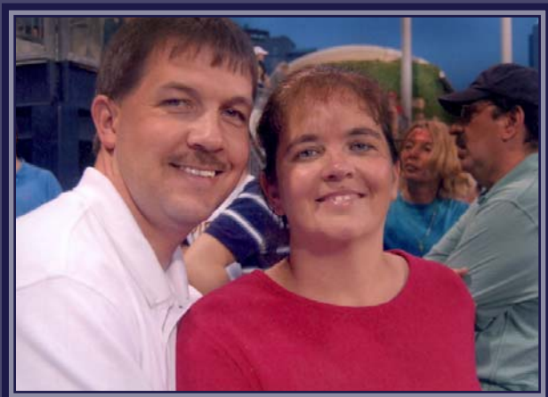
Rooting for a Favorite Team