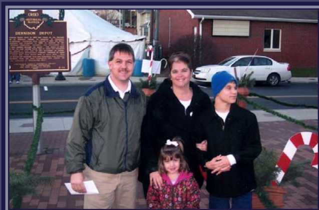
Getting Ready to Board the Polar Express