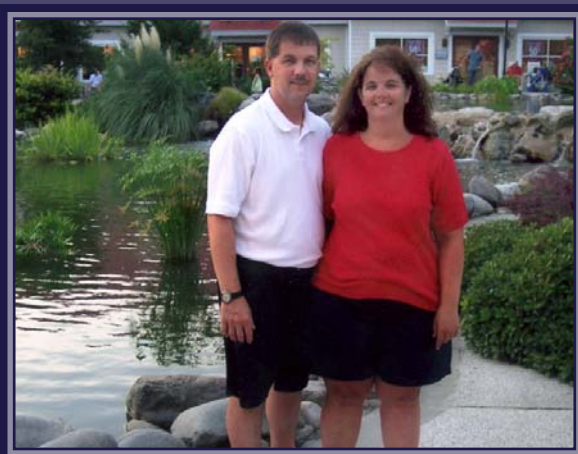
At Myrtle Beach