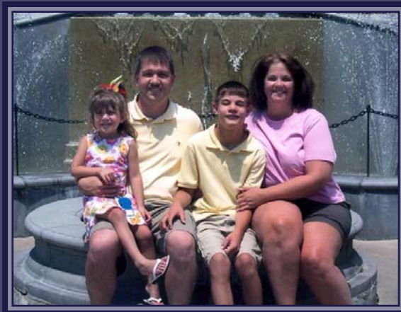
At the Zoo