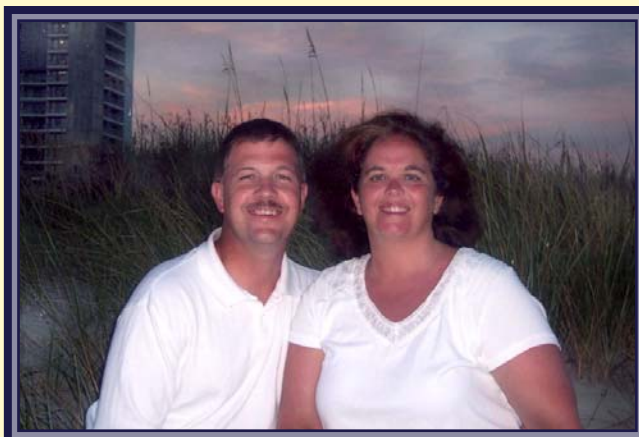
Pawley's Island, South Carolina