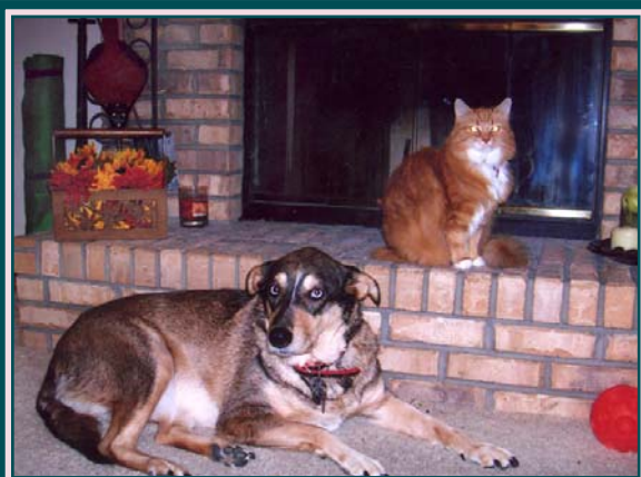
Our Dog, Ice and Our Cat, Liza