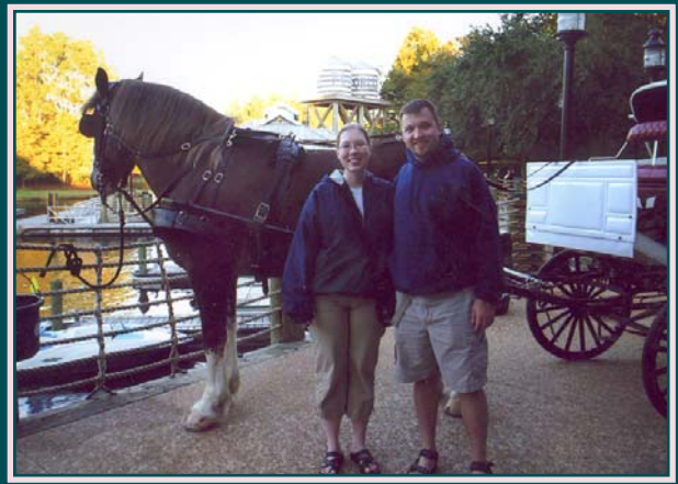
Horse Drawn Carriage Ride