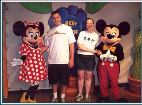
Two of Our Favorite Characters