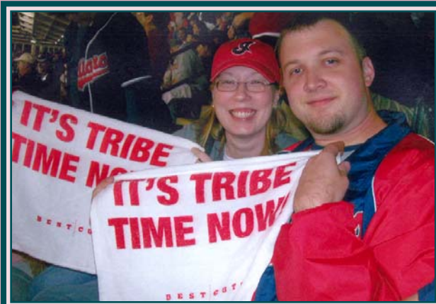
Cheering on the Indians