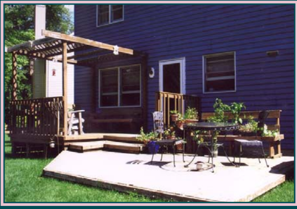
Our Back Yard Deck

We also have the "Homecoming" parade, which fills the streets with our high school sports teams, marching bands, and lots of candy for all of the kids. Just 30 minutes away, you'll find the zoo, several museums, a theater district, and the beach.