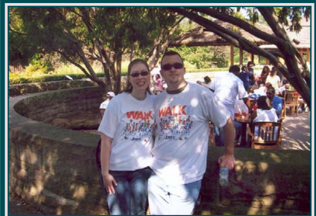
Walk to Cure Diabetes - We Do This Walk Every Year!