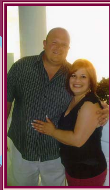
Sightseeing in Jamaica