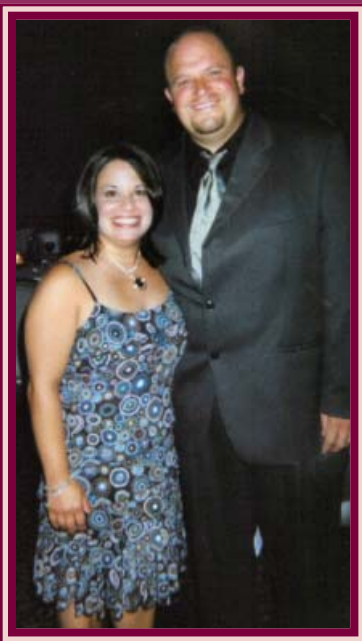
Fun at a Friend's Wedding