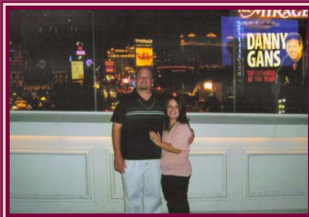
Catching a Show in Las Vegas