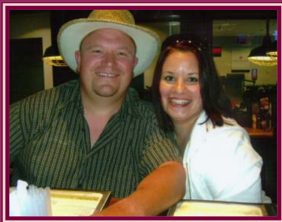
Having a Nice Dinner