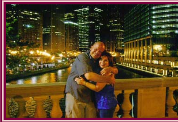
An Evening in Chicago