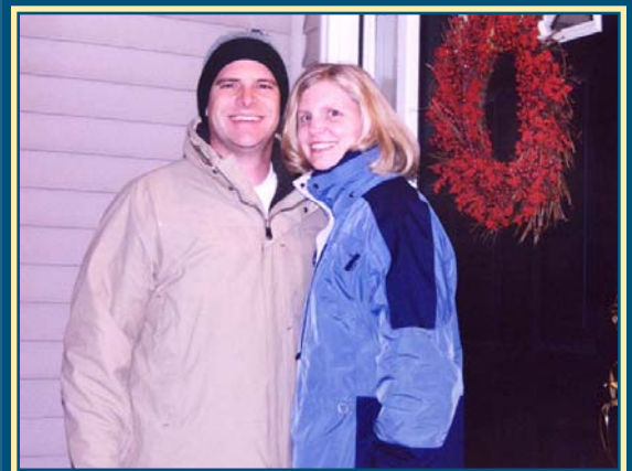
Happy Holidays at Our House