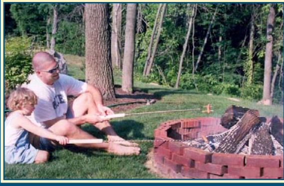
Cooking Hotdogs in Our Backyard