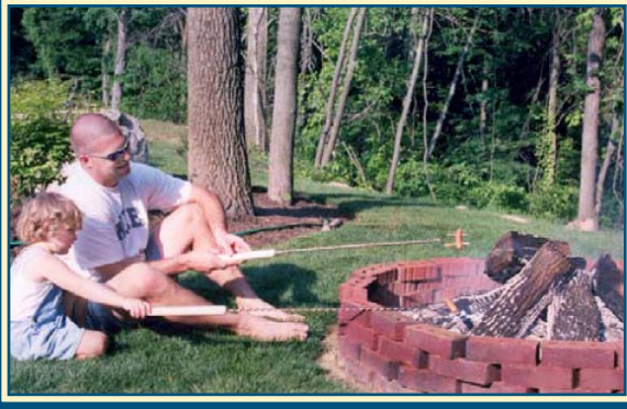
Cooking Hotdogs in Our Backyard