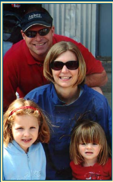
Memorial Day Parade