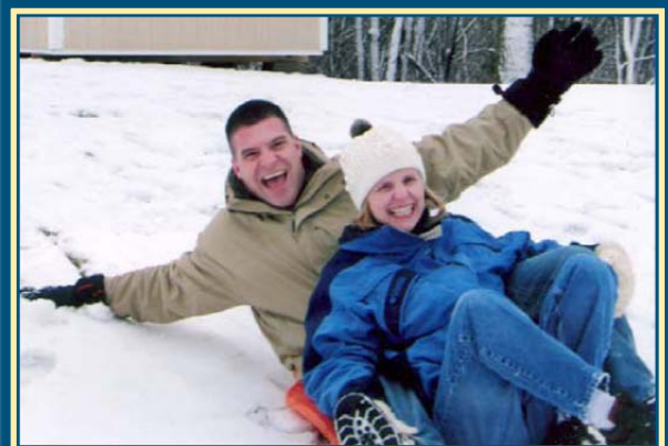
Sledding in Our Back Yard