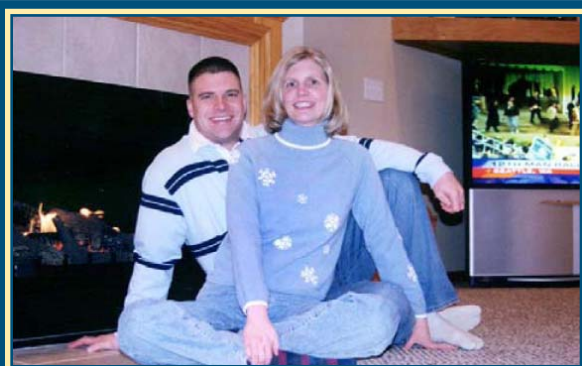
A Cozy Fire at Home