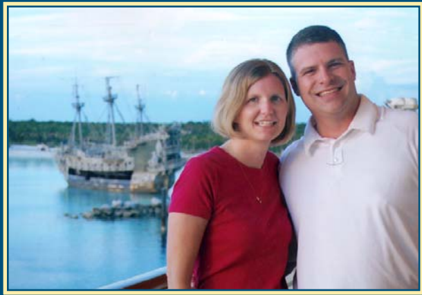
Taking a Cruise