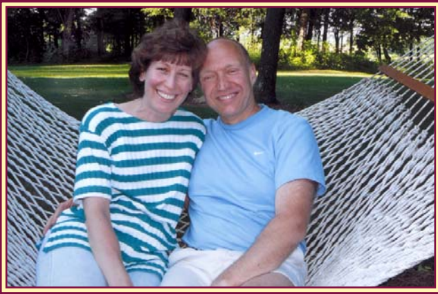
Together in the Hammock