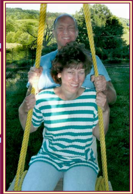
Riding the Tree Swing at a Resort in Pennsylvania