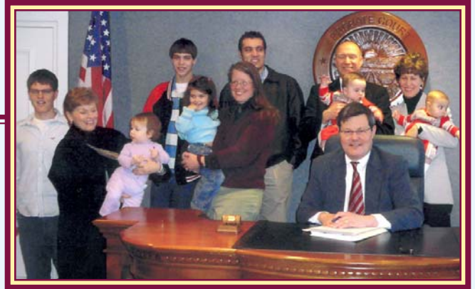
Some of Our Extended Family at the Adoption Finalization for Our Twins

We spend most holidays with one family or the other and Christmas and Thanksgiving are usually spent with both of our families. We always know where we are going for the holidays because there are only a few family members with big enough houses to accommodate the entire families.