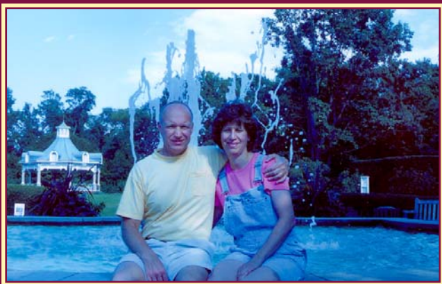
Ready to Take the Plunge at a Park Near Home