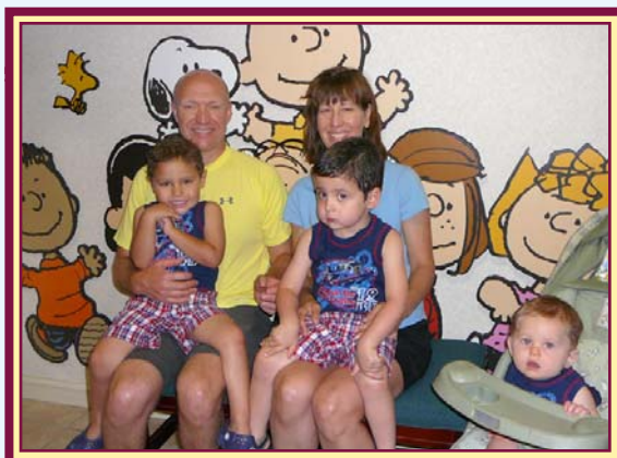
The Whole Gang on Vacation