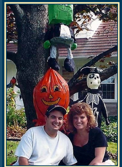
Trick or Treat