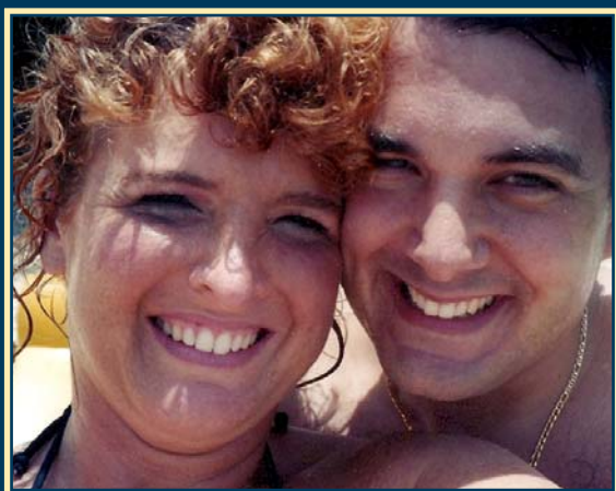
Poolside in Jamaica