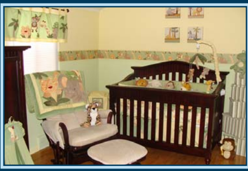
The Newly Decorated Nursery