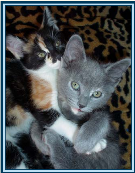
Ginger and Bambi