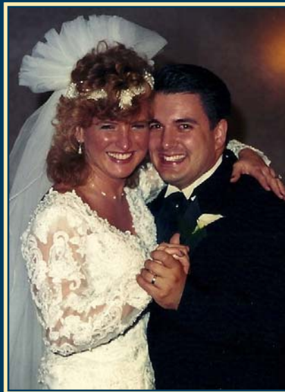
Our First Dance