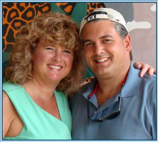
A Day at the Zoo