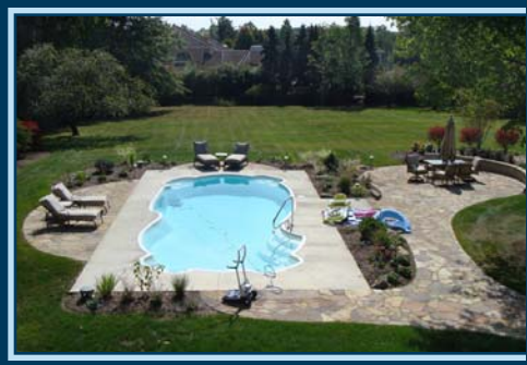
Our Backyard Retreat