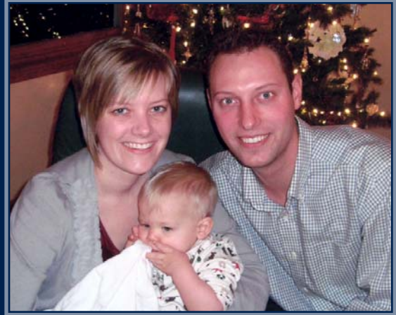
Posing for a Picture at Christmas Before the Gift Unwrapping Madness Began