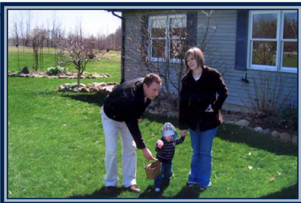
Daddy and Mommy Helping Me Hunt Easter Eggs