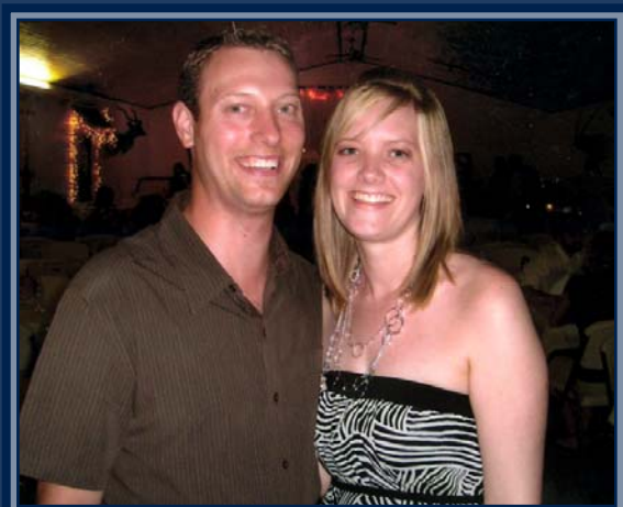
Smiling for the Camera at a Family Wedding