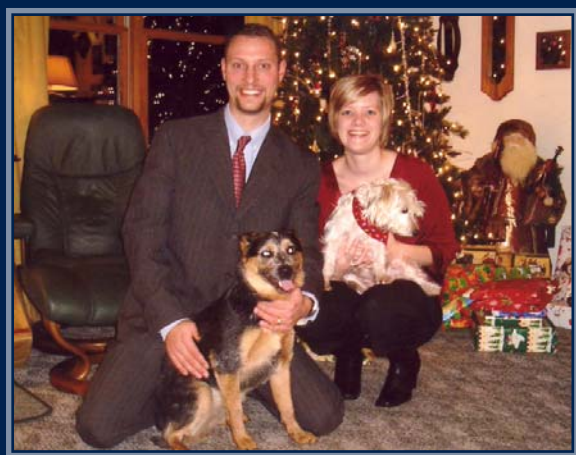
Family Christmas Pose with Our Dogs, Lita and Lasso