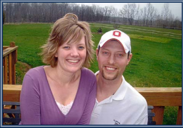
Hanging Out on Grandparents' Deck