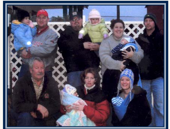
All of the Family at Christmas Tree Farm