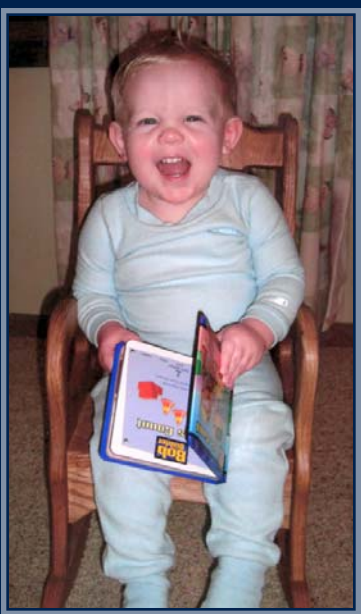
I Love to Sit in My Rocking Chair and Read