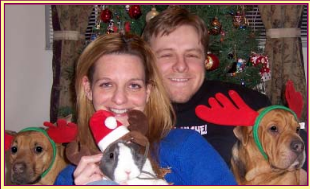
A Fun Christmas Picture with Our Furry Kids!