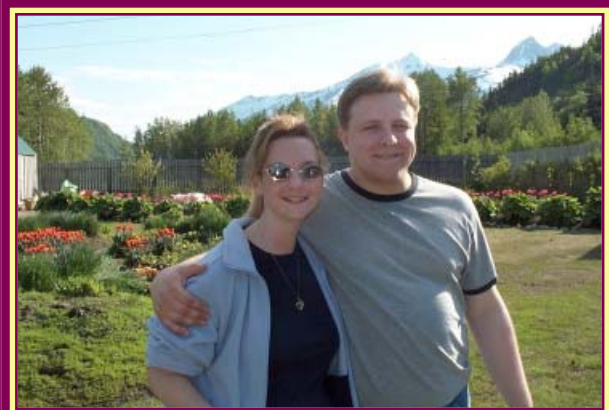
Enjoying a Beautiful Alaskan Garden