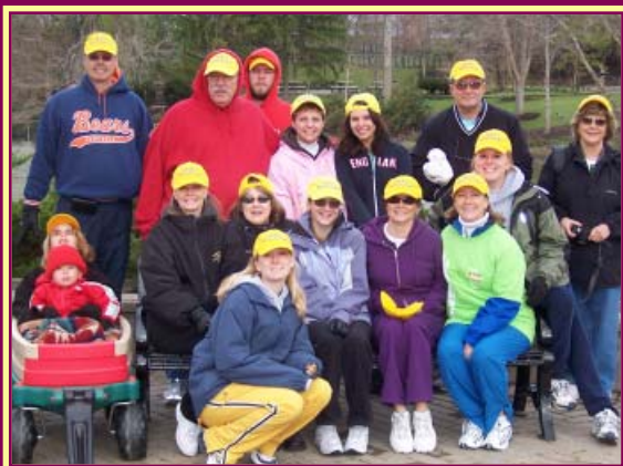
MS Charity Walk with Family