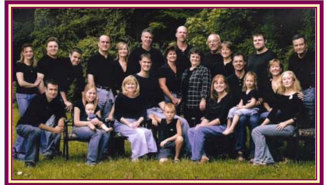
Extended Family Gathering