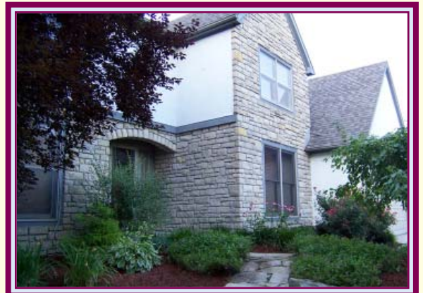
Our Beautiful Home

We envision family game and movie nights in the great room and look forward to filling our kitchen table with coloring books, crayons, and play-dough! The front yard is beautifully landscaped with wonderful flowers and trees.