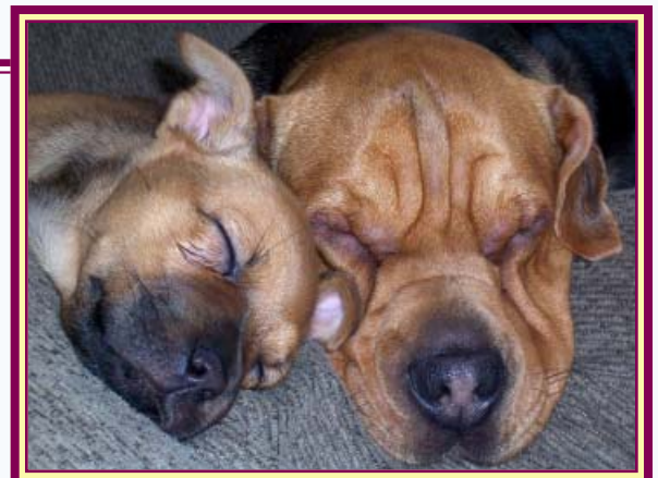
Monty & Stella

Our "furry kids" bring us so much joy. They make us laugh every day. It is so much fun to watch them interact with each other and with us. Their personalities are so dynamic and they make us smile! Finnigan is our bunny rabbit. He is 9 years old and he is the sweetest bunny. He loves to cuddle under your chin when you pick him up. Monty is one of our rescue dogs. We adopted him when he was 8 weeks old. He is part Shar-Pei and has a squishy, wrinkly face that makes everyone smile. He loves to cuddle with us and gives us lots of kisses! Stella is our 2nd rescue dog. She, too, was adopted when she was a puppy. She is so beautiful and has the biggest personality. She makes us giggle all the time. All of our pets bring so much joy, laughter, and unconditional love to our lives. We love taking care of them. The fact that they love us back is just a bonus!