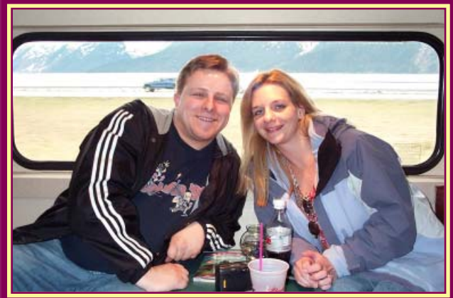
Train Ride in Alaska