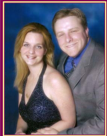
Our Formal Cruise Photo