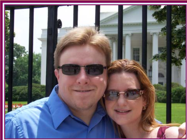
In Front of the White House