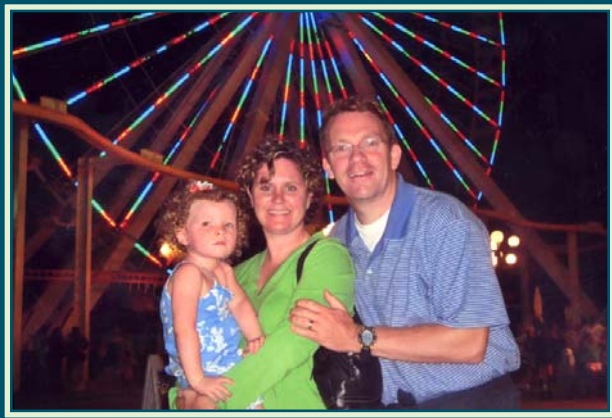
Jersey Shore on the Boardwalk