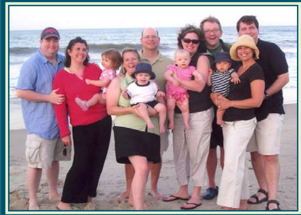
Outer Banks with Friends