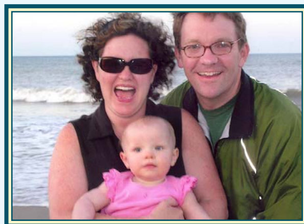
Our Annual Trip to Outer Banks, North Carolina

However, our favorite trip is the one we take each year to the beaches of North Carolina. We enjoy a week of outdoor activities - swimming, sand, sun and laughter. For the past several years we get a house with three other families - all of whom have young children. The kids have an absolute blast. We spend most of our time at the beach or the pool (with the occasional rainy day spent visiting nearby historical sites). Each night one family takes a turn cooking dinner and cleaning up while the others take the kids on a bike ride in bike trailers or to the playground. The memories made on these trips are priceless and we would love to share what we have with another child.