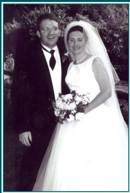
Our Wedding Day