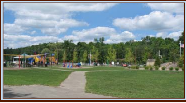
Our City's Sprinkler Park

We have a backyard with a wooded area and space for a vegetable garden, which we plant every year. We have a brick patio with a pergola and enjoy grilling and having fires in our chimenea that we make smores with; while swinging on our glider on summer/fall evenings. Our yard was landscaped by us and we have spent years planting trees and flowers of all kinds to enjoy the beauty of nature.