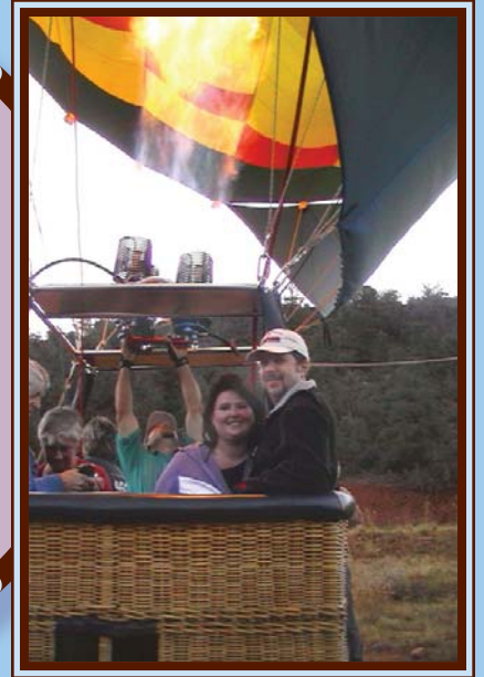
Hot Air Balloon Ride