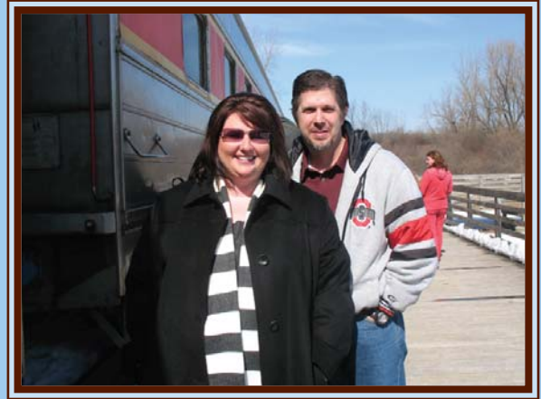
A Fun Train Ride