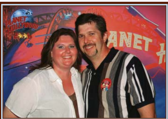
Our 10th Anniversary at Disneyland