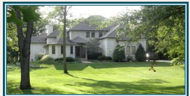
The Front of Our House

We moved to the Columbus area almost three years ago after both living in Chicago for over 10 years. Today, we live in a large suburb that has a chocked full calendar of activities throughout the year. Our house is on a secluded street that is very quiet and not well-traveled, but our backyard backs up to a new housing development filled with many young families. We look forward to being the neighborhood destination spot for birthday parties, slumber parties and backyard barbeques. At the end of our street is a huge playground, as well as baseball diamonds and soccer fields. Also, we live in an award-winning school district with opportunities for kids with all kinds of interests.