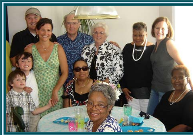
A Summer Party with Friends