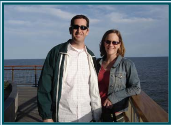
On The New England Coast