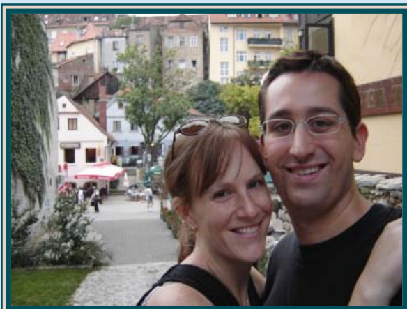
Sightseeing in Zagreb, Croatia