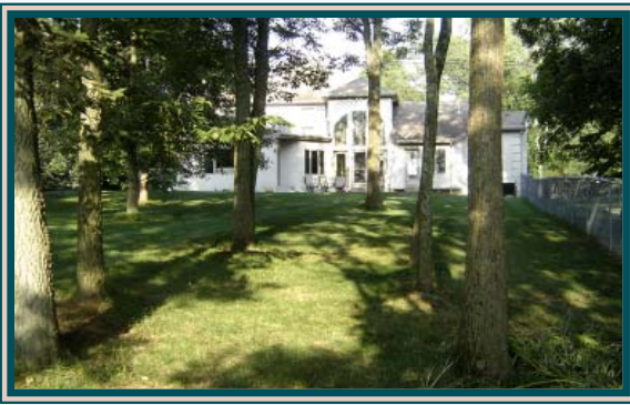
The Back of Our House