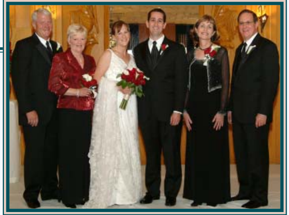
Our Parents on the Big Day