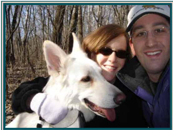
A Winter Hike with Looshie

When we were first together, we had a black German Shepherd named Connie. Two years after finding Connie, she developed the canine form of multiple sclerosis. It was so painful to watch the disease progress in her. Over the course of a year, she slowly became paralyzed in her back legs. Many thought it was ridiculous the lengths to which we went to ensure her comfort and happiness in the last months of her life. We feel that time and effort is a testament to how intensely and purely we love those closest to us.