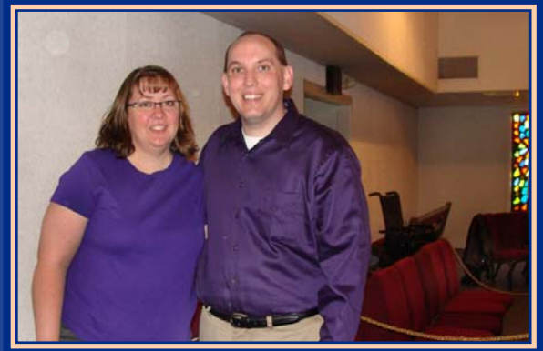
Attending Church Service