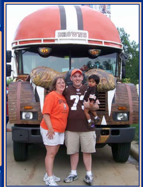
Cleveland Browns Game