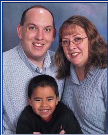
Our Family Photo