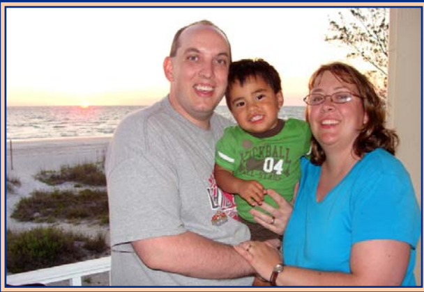
Family Vacation in 2009