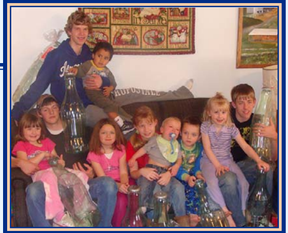
Cousins at Christmas