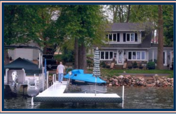
Our Family's Lake House