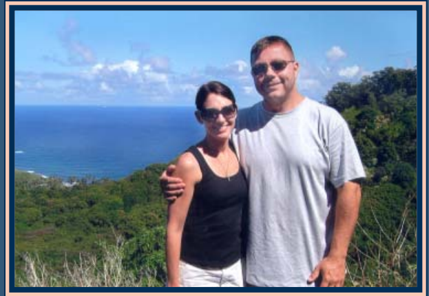
Enjoying the Hawaiian Coast