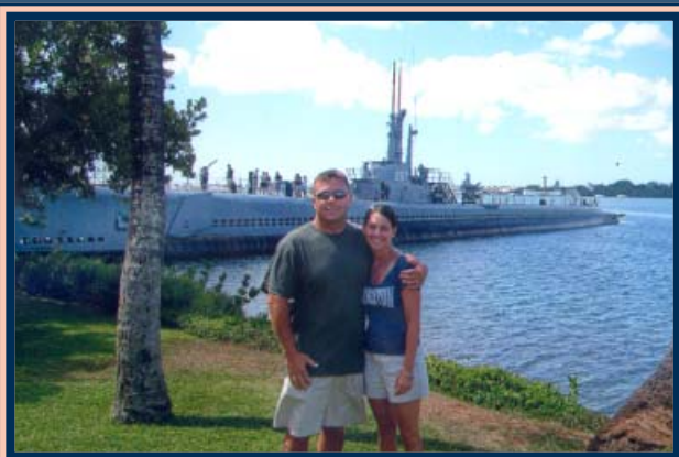
Sightseeing at Pearl Harbor