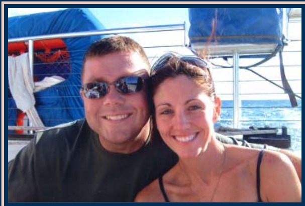
Going Out for a Sail