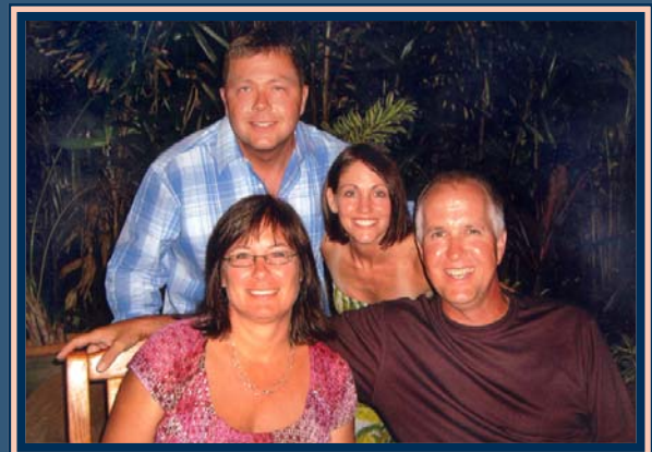
A Night on the Town with Friends