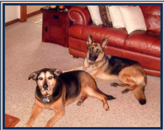
Bella and Shelby Relaxing

We have been fortunate to raise dogs that have become family. Our two girls, Bella and Shelby, are the loves of our lives. Shelby is our 13 year old mixed breed. She has been with us for over 12 years and is starting to show her age. Bella is our 3 year old German shepherd and is the main reason Shelby stays young. Bella is a high energy, ball chasing machine. She has been professionally trained and is a wonderful, well-mannered, young lady. One of her greatest qualities is that she absolutely adores children. The girls are always so excited to see us whether we are gone 5 minutes or five days. The worst possible day at work goes out the window when we pull up the driveway and see them waiting at the window with tails wagging. They do a good job of filling the void in our lives and they look forward to having a play mate they can call their own. Both girls are very well socialized and trusted by all the parents in our neighborhood. Kisses are abundant and may be given with little or no notice.