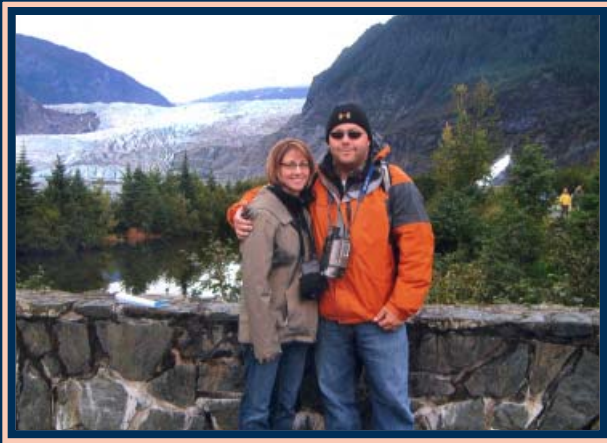
Hanging Out in Alaska