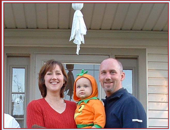
Getting Ready to Trick-or-Treat