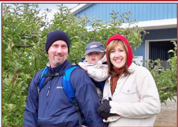
A Cool Day at the Apple Farm