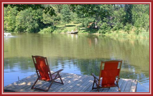
Part of Our Back Yard