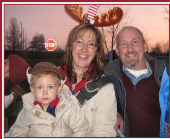
Riding on a Float in the Christmas Parade