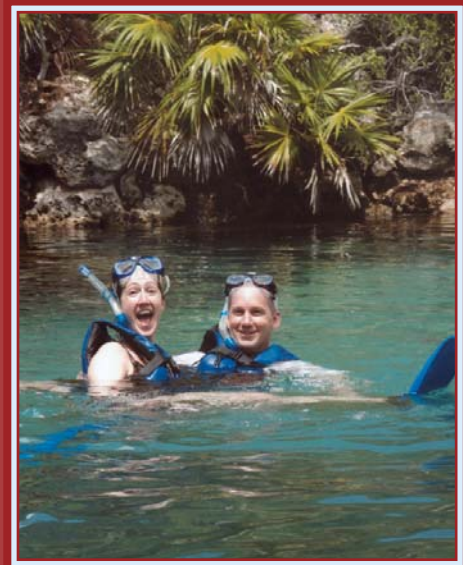
Having Fun While Seeing the Ocean Life Up Close