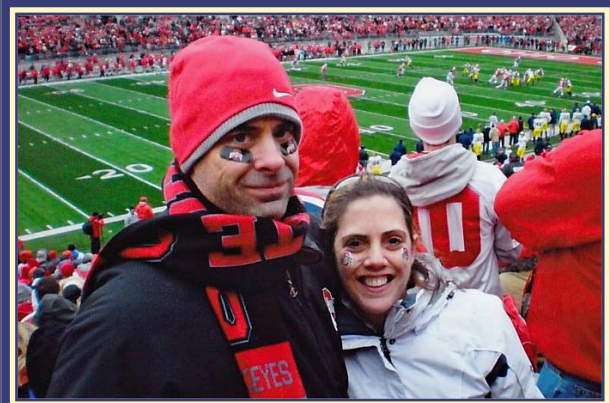
OSU vs. Michigan Football Game