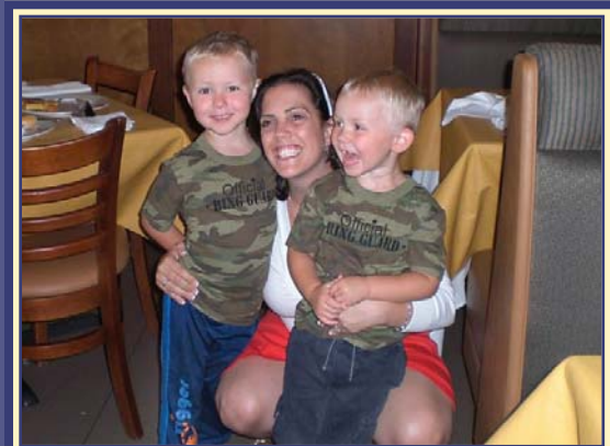
Family Brunch After Our Wedding - With Our Nephews, The Ring Bearers