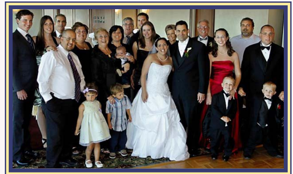
Our Wedding with Relatives