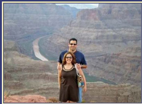
The Grand Canyon