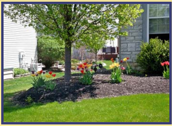
Springtime Flowers Around Our Home

We love to take care of flowers around our house from tulips in the spring to mums in the fall, but our favorite are beautiful tall rose bushes that bloom from May to November. We have so much fun decorating for fall holidays and Christmas. We could not ask for better neighbors/friends. We often have weekly cookouts with 8 families where we rotate houses each week in the summer months.