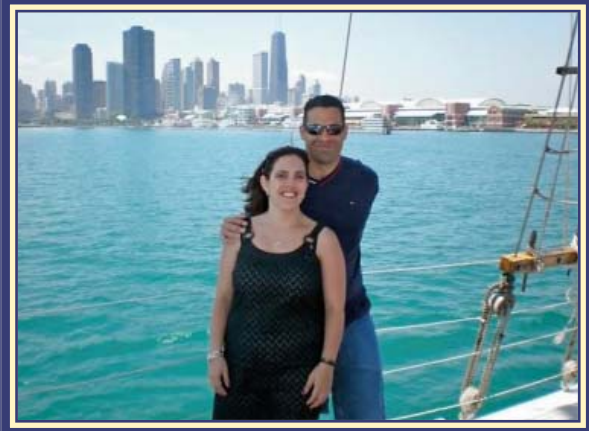
Birthday Weekend in Chicago