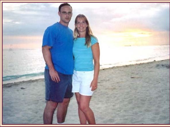
Waikiki Beach, Hawaii