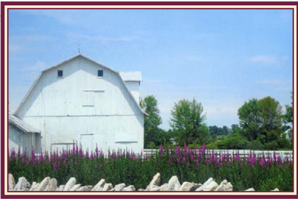
Entry to Our Neighborhood