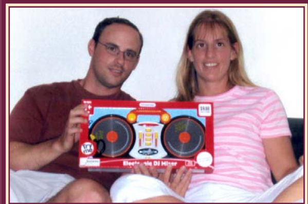
Foster Parent Gift Shower