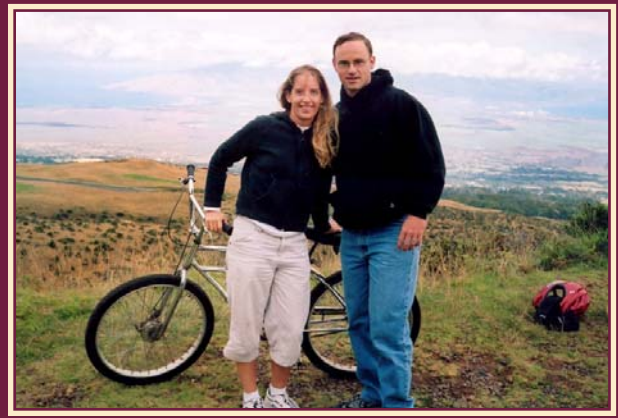
Biking Down a Volcano in Maui