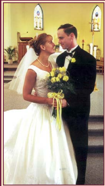
Our Wedding Day