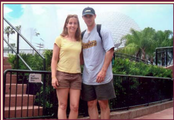
Vacation at Epcot Center