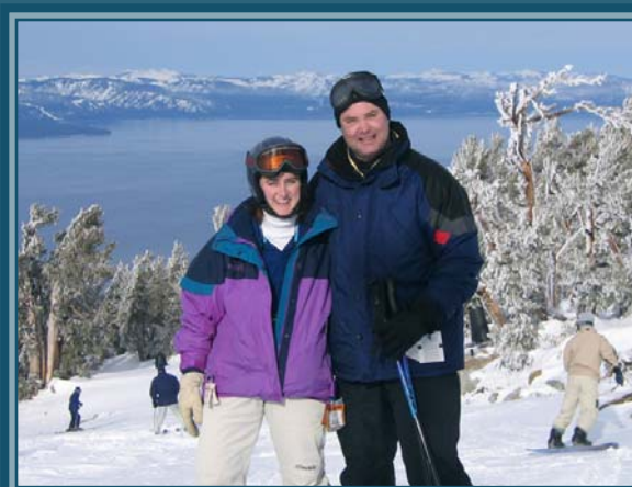
Skiing in Tahoe