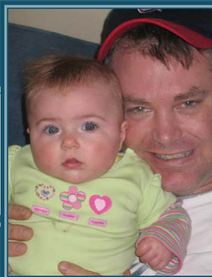
Daddy's Little Girl