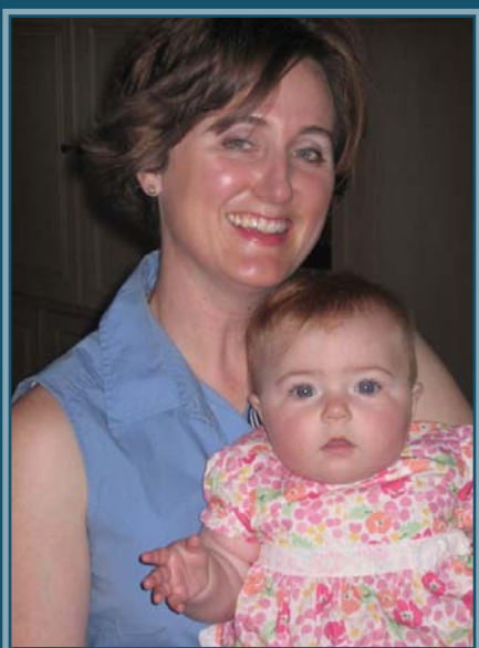
Mommy's Pride and Joy