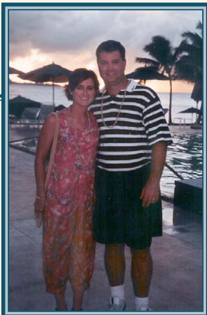
Luau at Hanalei Bay

Cape Cod and Ireland are very similar to us. We have been able to enjoy time together in these places. They both allow us to relax. Both are family-friendly places we would like to take our family.