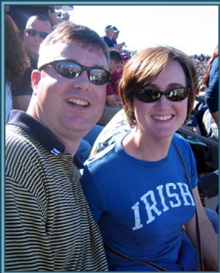
At a Notre Dame Football Game