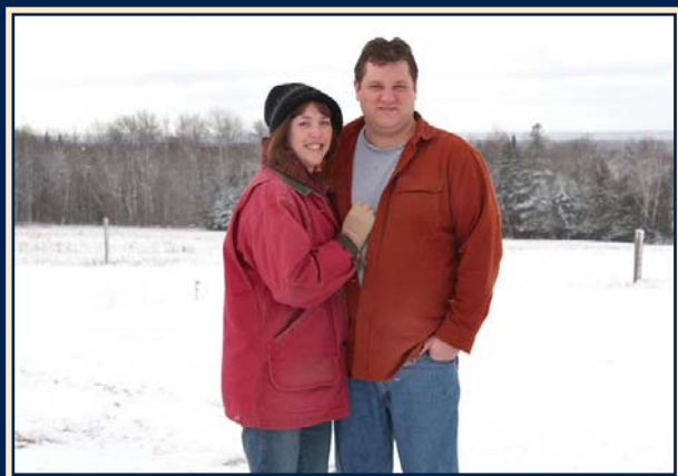
Out in the Snow