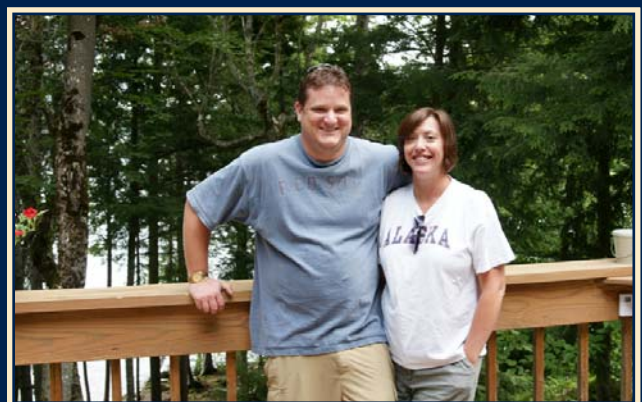
Enjoying the View