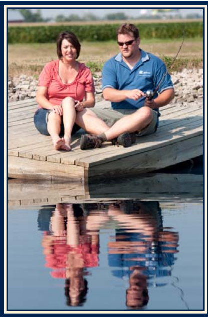
On the Dock

Some of the annual events that bring the community together are a local fishing derby and the annual Blaze of Lights parade and festival. Every May the fishing derby is held at one of the community parks with chances of winning prizes for catching tagged fish. Every Thanksgiving brings the annual Blaze of Lights Parade. This is a large parade involving nearly the whole community that ends with the lighting of the downtown Christmas displays for the upcoming season.