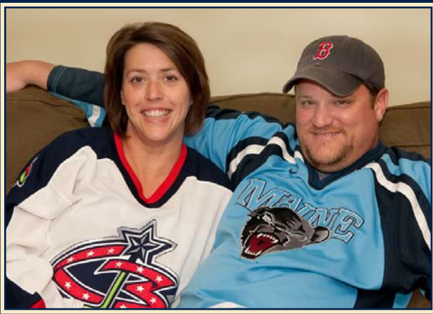
Relaxing at Home