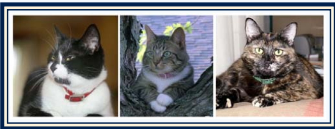
Our Three Cats: Depot, Barney & Wookie

We currently have 3 cats, whom some would classify as spoiled. Depot is our social and nosey one. Whenever someone comes to our house, she's right there to greet them. She has a wonderful personality and plays well with our friends' children. Wookie, can be a little more shy, but she is a special one. She likes to fetch, and when we say it's time for bed, she runs into our bedroom and snuggles right in. Barney is our vocal one. Being the only male, he sure has a lot to say. He was a stray that we adopted, and he has managed to melt our hearts. Our cats are an important part of our family, providing us with much comfort and joy.