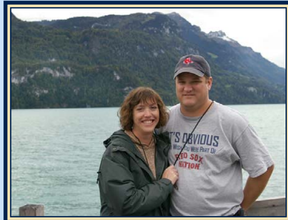
Vacation Fun by the Water