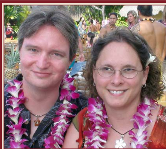
Vacationing in Hawaii