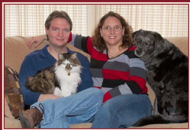
With Our Pets at Home