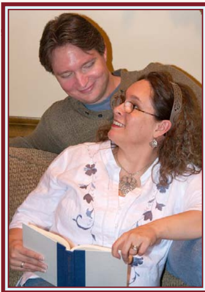
Sharing a Book

Family football parties and annual Christmas taffy pulls are a tradition we look forward to sharing with a new member of the family. Pumpkin carving, hiking, camping, wienie roasts and trips to the farm are all activities we are looking forward to sharing with a child.