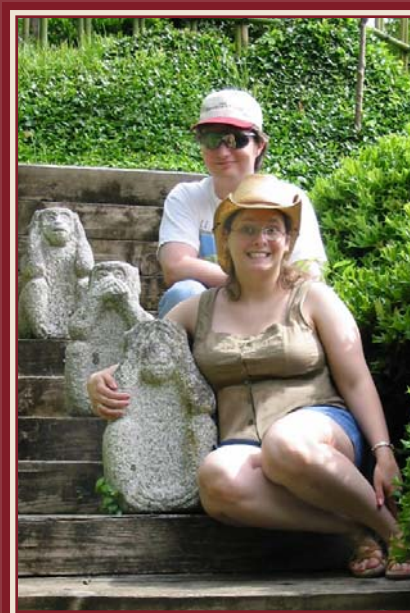
Touring Texas Gardens