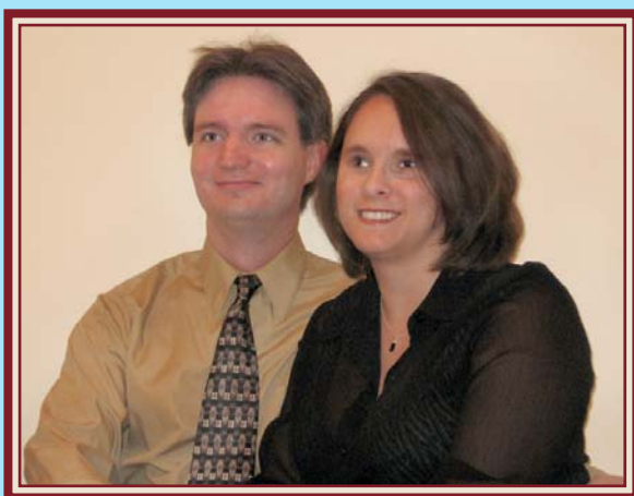
A Formal Date