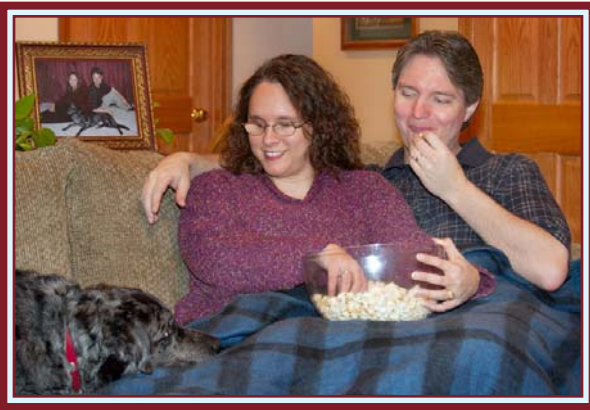
Movie Night at Home