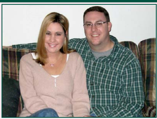
Ready to Watch a Movie

We, as well as our families, are ecstatic at the thought of having another child to share all of our life events. Traditional celebrations, such as holidays, birthdays and family parties will be filled with more excitement observing this child interact with our son, niece and nephews. Seeing this newborn grow-up and teaching him/her to walk, talk and write, among many other firsts in life, will be so rewarding. Then, watching this child develop into his/her own person with an individual personality will be gratifying. With us planning many fun events, for example going to shows, large playgrounds and picnics at the park, this child will learn quickly by watching his/her older brother. Proudly taking this child along to gatherings will be an event for the whole family. We will also love just hanging out at home, being with each other, reading books and playing.