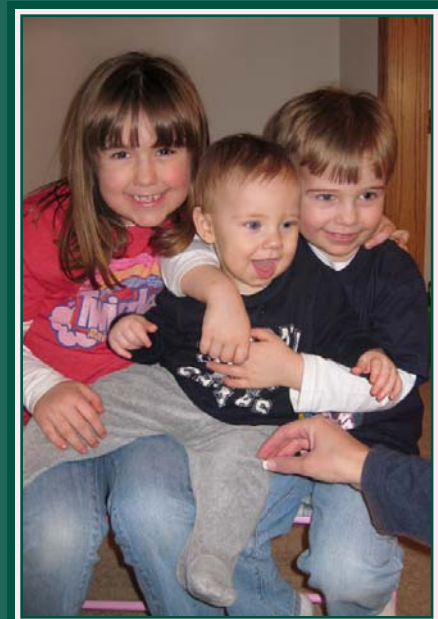
Hanging Out with My Cousins