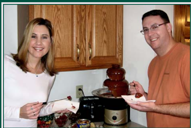
Eating Fondue at a Party