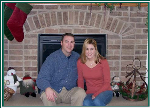
Relaxing During the Holidays