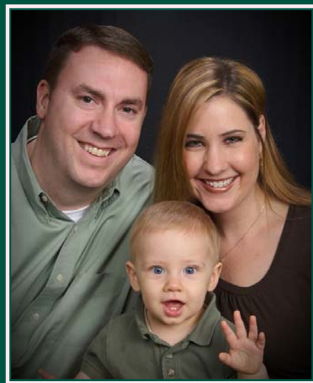
Our Family Photo