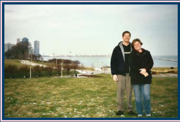
Our Chicago Vacation