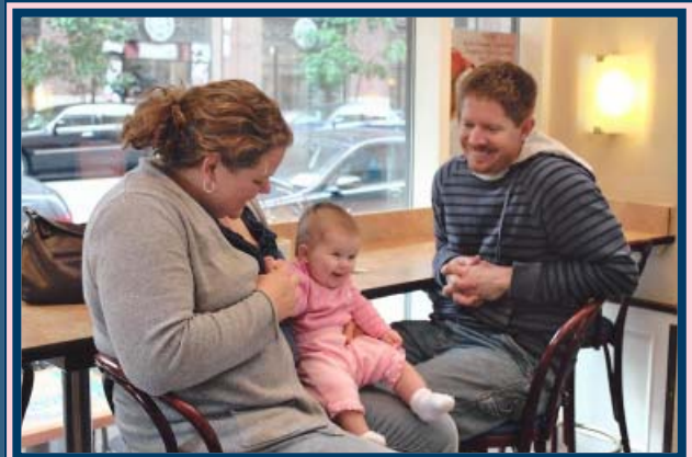
Playing with Our Niece