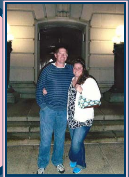
Our Trip to Madison, Wisconsin