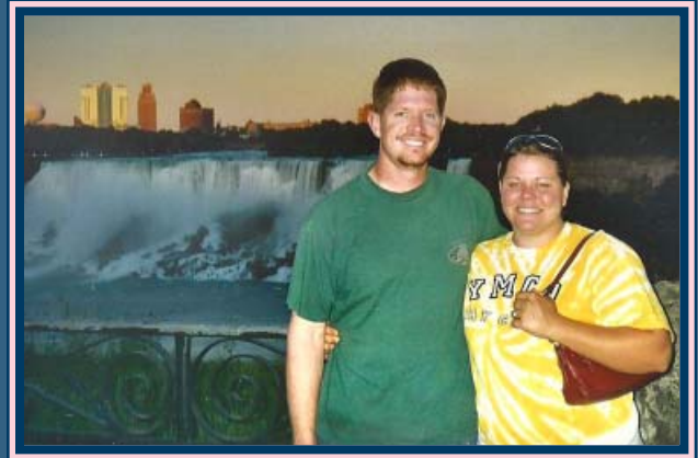
Niagara Falls, Canada