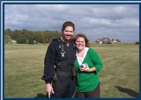
After Matt's Skydiving Adventure