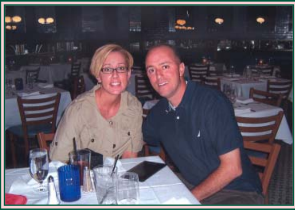
Enjoying Las Vegas, 2010