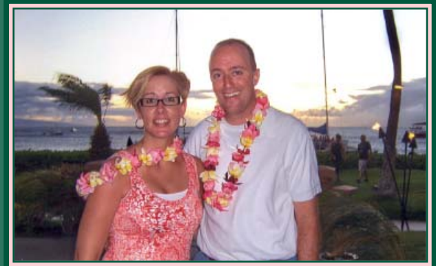
A Night Out in Hawaii On Our 5th Anniversary