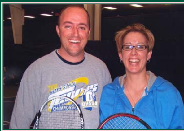
Before a Tennis Match