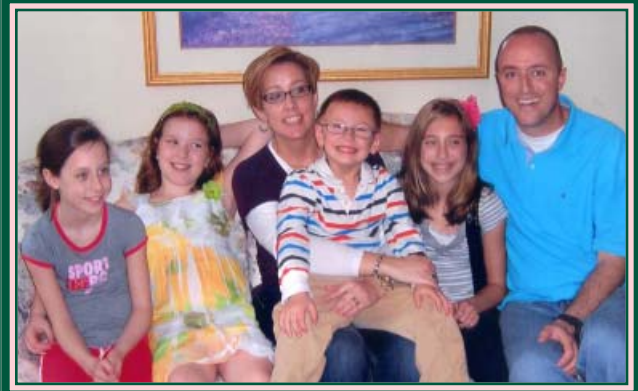
Spending Time with Our Nieces and Nephew