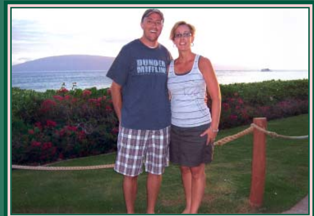
Sight Seeing in Hawaii