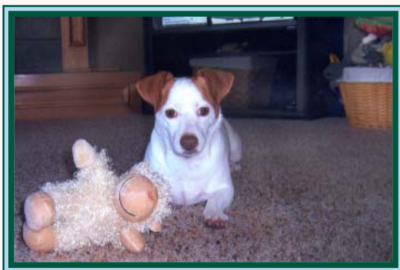
Our Friendly Dog, Joey, With His Favorite Toy