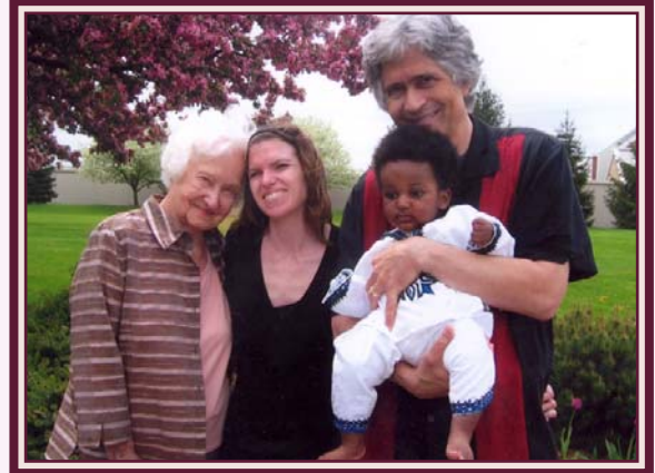
Moses' Baptism with Michael's Mother