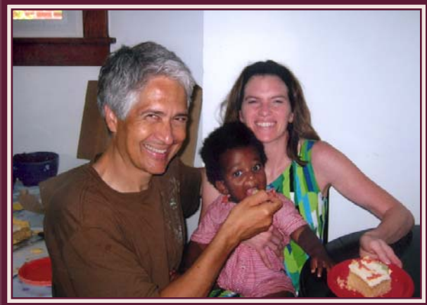
Moses' 1st Birthday Party!