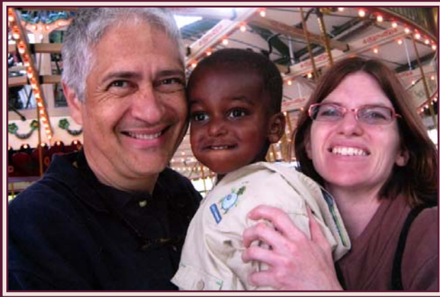
Our Family on the Carousel