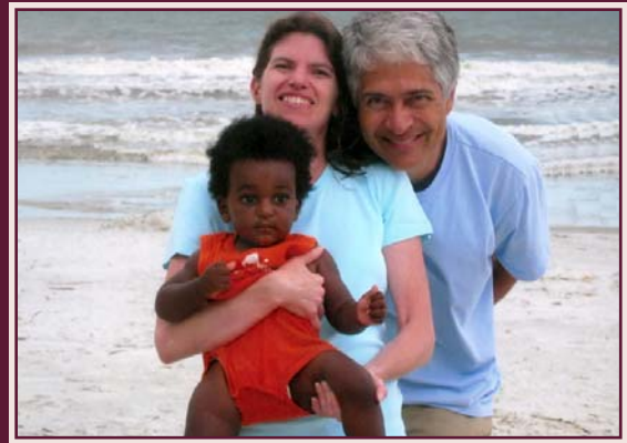
On the Beach at Hilton Head