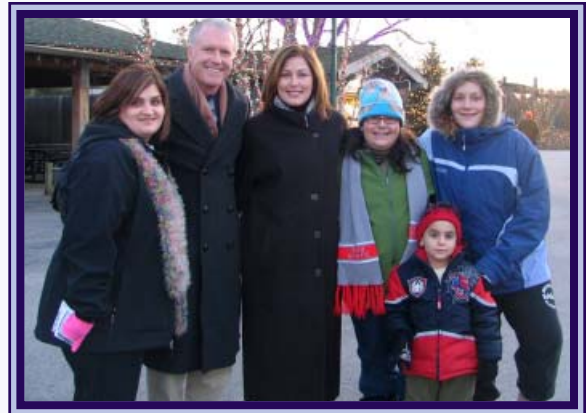
Sister, Nieces and Nephew in Toledo