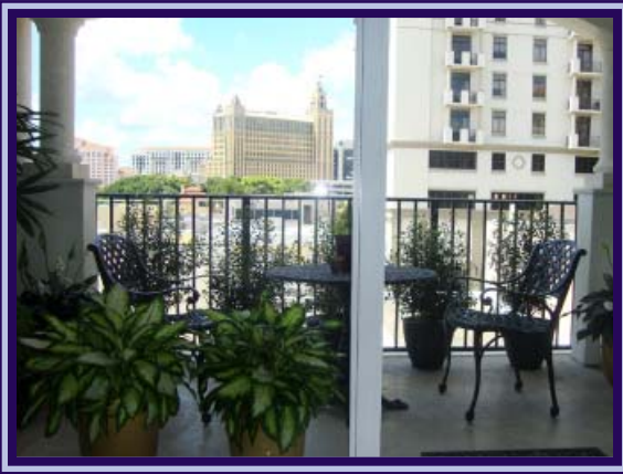
View From Our Balcony

Every Halloween children parade in their costumes as their parents escort them to “trick or treat” along the shops and restaurants of the main street. We are within 15 minutes from the beach, a botanical garden, a tropical bird museum, a science museum and downtown for major sports and theater events. The zoo, fruit farms, everglade parks and the Kennedy Space Museum are entertaining and educational activities that we can’t wait to experience with a child.