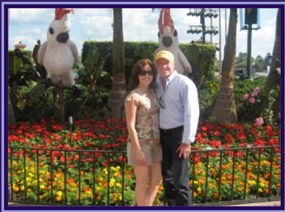
Epcot Flower Show