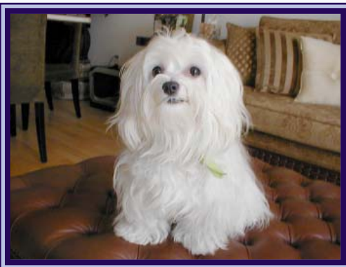
Valentino's 1st Birthday

We love animals! Valentino is like a living stuffed animal because he is so adorable and affectionate. He gives so much unconditional love and joy to both of us every day. Every time we walk through the front door, he eagerly greets us as if it is the first time that he has ever seen us.