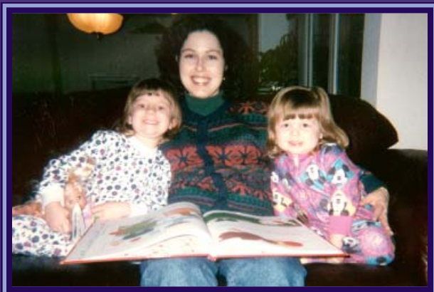
2nd Cousins Bedtime Stories