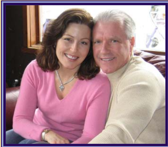
Relaxing for Lunch