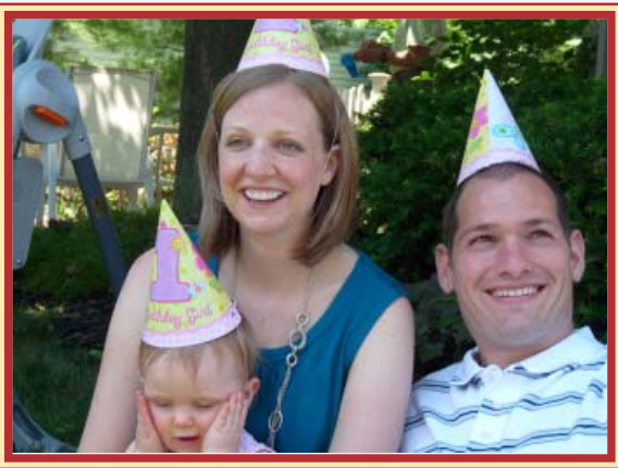
Cami's First Birthday Party