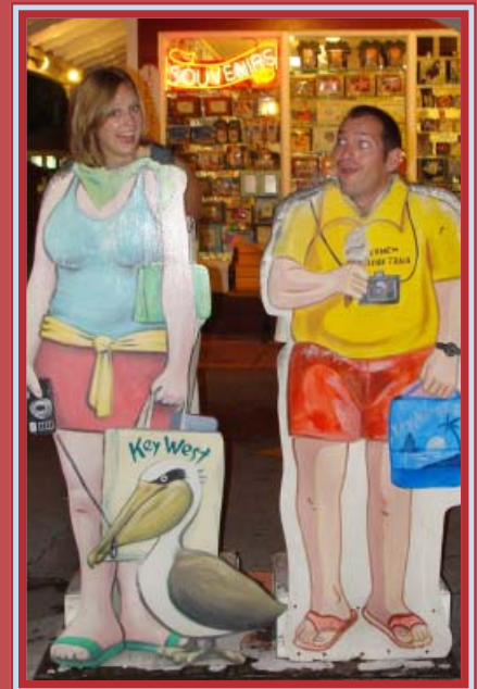
Posing as Tourists in Key West